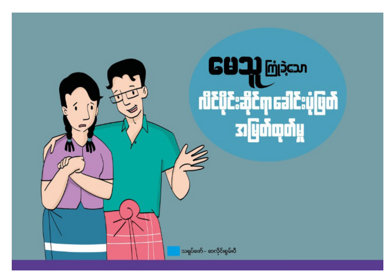
Comic Book: With the support from PSEA network, ActionAid Myanmar has developed a Comic Book to raise awareness on SEA.