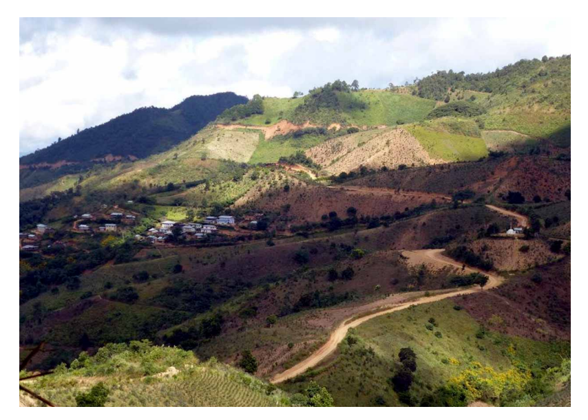
Photo 1. Rural Southern Shan State, Kalaw, December 2012.

government's struggle to assert control, often violently through military-led counterinsurgency campaigns (including the notorious Four Cuts Campaign, which tried to break the links between insurgents<sup>55</sup> and local populations and so deprive resistance groups of access to recruits, food, finance, and intelligence) has made local populations wary about state encroachment, which they have invariably experienced as military abuses, forced labor, expropriation of property, taxation, and intolerance of cultural diversity. This environment strengthened local strongmen and armed groups who proved able to hold the state at bay. By the 1980s, the Shan State borderlands were a complex "field of power" marked by intense contestation over the three power resources that govern state—society relations: a multitude of armed groups were undermining the central government's struggle for control over the means of coercion; opium production and opposition forces' control over the country's flourishing black market cross-border trade created lucrative revenue streams beyond the control of the government; and ethno-nationalism and demands for a federal constitution became powerful counter-narratives to the government's own efforts to forge popular sovereignty under a centralized unitary state (Photo 1).