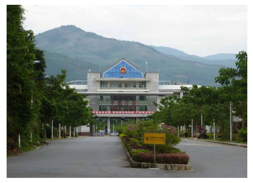
Photo 2. Myanmar-China checkpoint in Mong La, special region 4, May 2013.