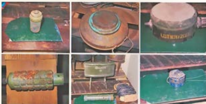
Landmines believed to have been used in Myanmar.

The study managed several complications and limitations, the most important being the absence of a systematic and organized victim information system (VIS) in Myanmar. Information collection has been sporadic and inconsistent throughout the country, and providing reliable figures on the impact that landmines have on society is impossible. Due to the continuation of armed hostilities between national armed forces and some of the NSA groups, mine action is still a very sensitive issue, and information about victims remains touchy. The absence of a victim-surveillance mechanism is detrimental to the assessment of the contamination and the accurate documentation of its humanitarian consequences. This unavailability also hinders the planning and implementation of victim assistance programs that could provide the required support to survivors and their families.