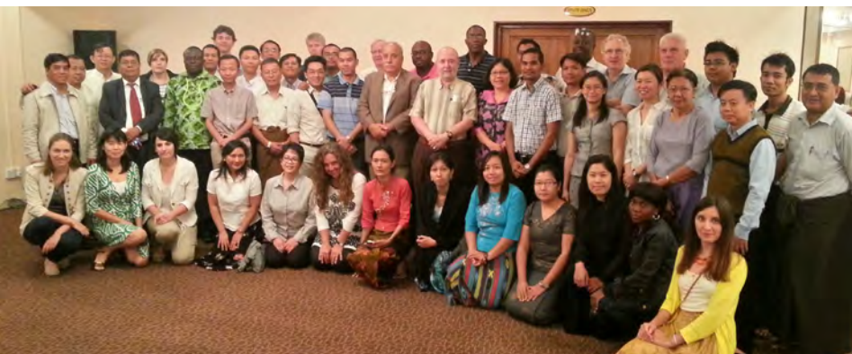
The Mission comprised 47 experienced observers, 23 international and 24 Myanmar nationals. These teams of experts were composed of statisticians, census experts, demographers and social scientists.

The International Technical Advisory Board (ITAB), a group of 15 experts from different countries and institutions involved in censuses and statistics internationally, will work with the Department of Population (DoP) to find ways of credibly estimating the population of the areas that were left out of the enumeration.