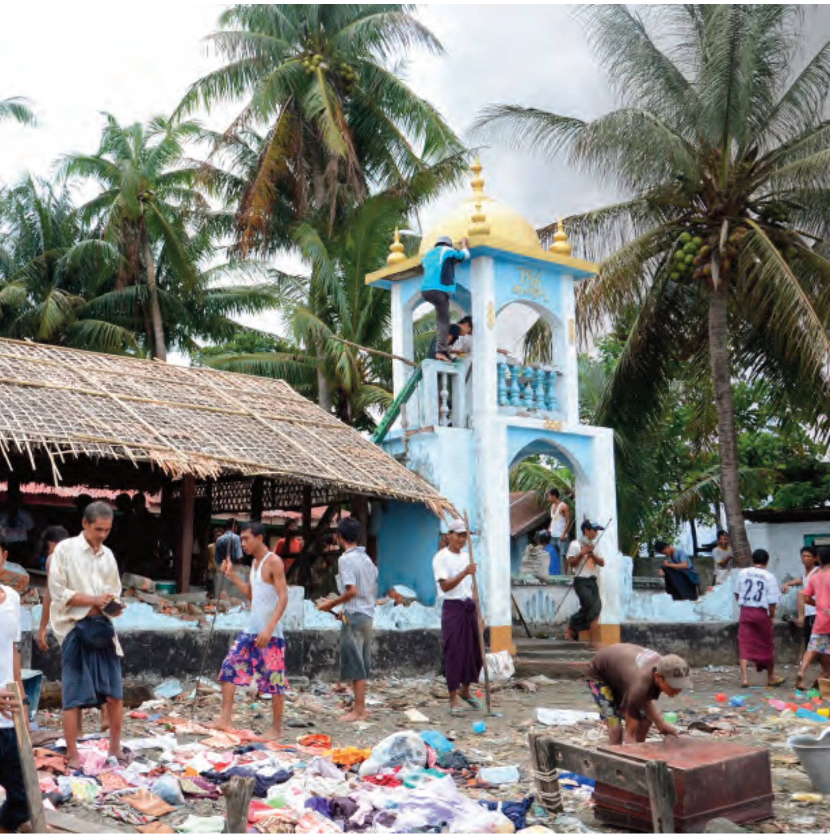
Local Arakanese dismantle and loot the site of a destroyed mosque in Sittwe, June 2012.