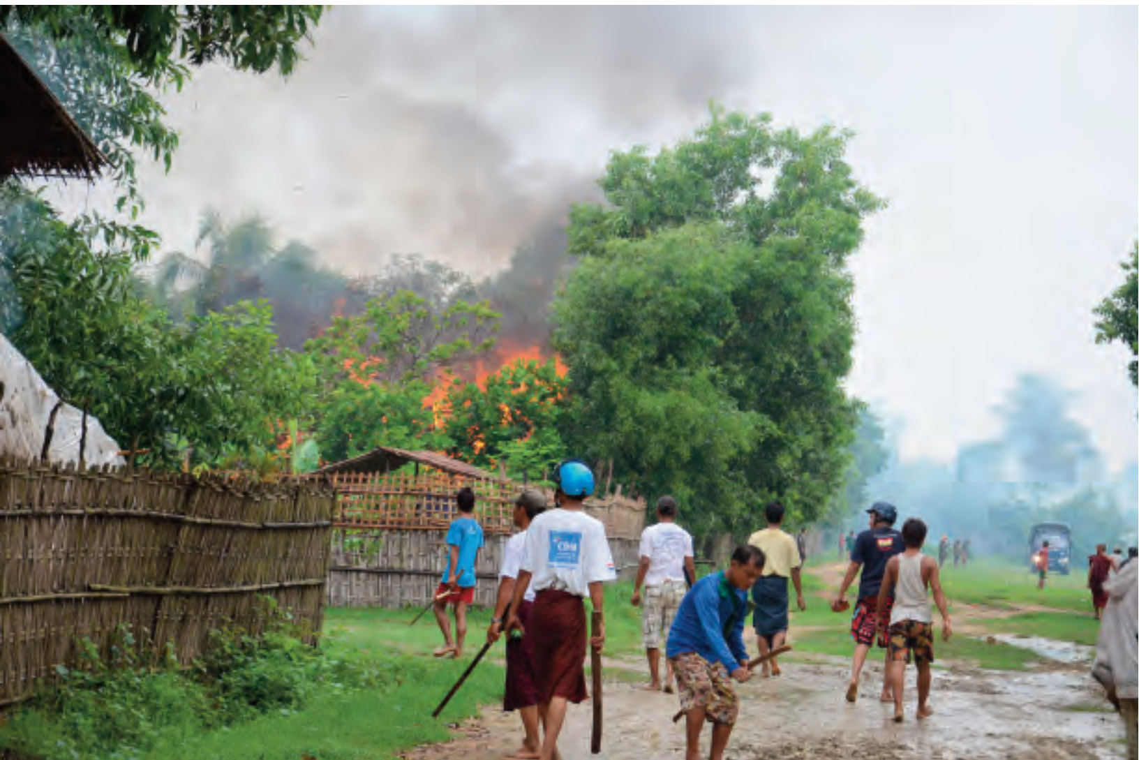
A group of Arakanese with weapons approach a Muslim village already in flames. Sittwe Township, Arakan State, June 2012.