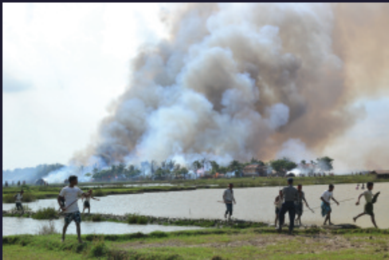
Ethnic Arakanese with weapons walking away from a village in flames while a soldier stands by. Arakan State, Burma, June 2012.

Many of the crimes documented in this report amount to crimes against humanity carried out as part of a campaign of ethnic cleansing. Human Rights Watch calls on the Burmese government to urgently end abuses by state security forces and punish those responsible, ensure access to humanitarian organizations, and amend discriminatory provisions in its citizenship law.