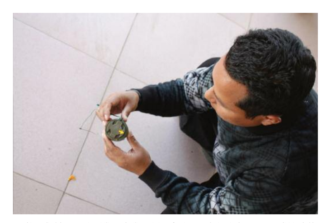
A Kachin medical doctor treating civilian and military victims of antipersonnel mines in the KIA's eastern division holds a Burmese army landmine. He told Human Rights Watch that mine-related casualties are on the rise: "The difference between Kachin and Burmese landmines is that the KIO mine blasts shrapnel inside the body, whereas the Burmese one is not shrapnel, but a blunt force explosion, usually taking an entire limb."