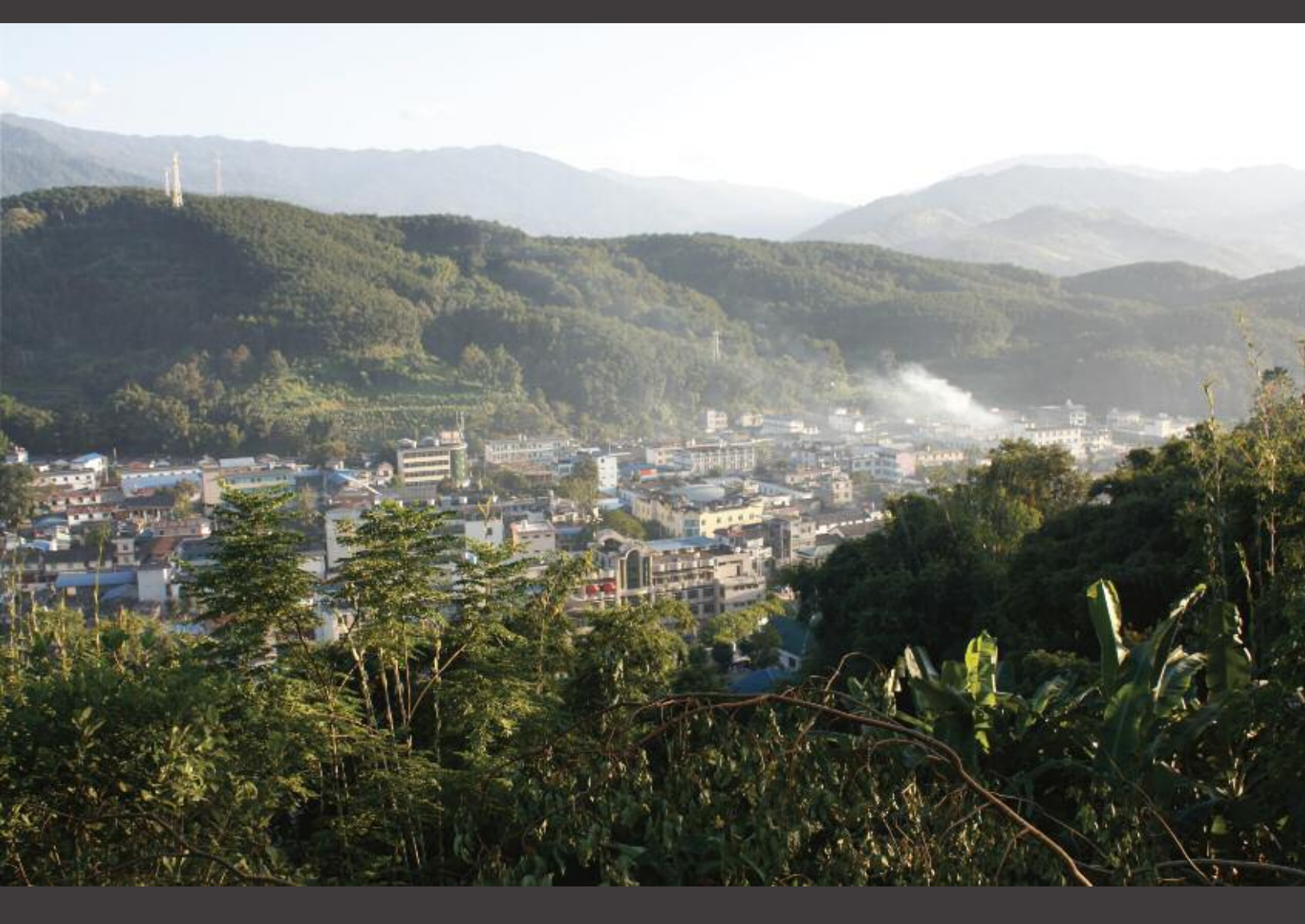
The KIA's proclaimed capital, Laiza, which is directly split in half by the border with China's Yunnan province in the background.