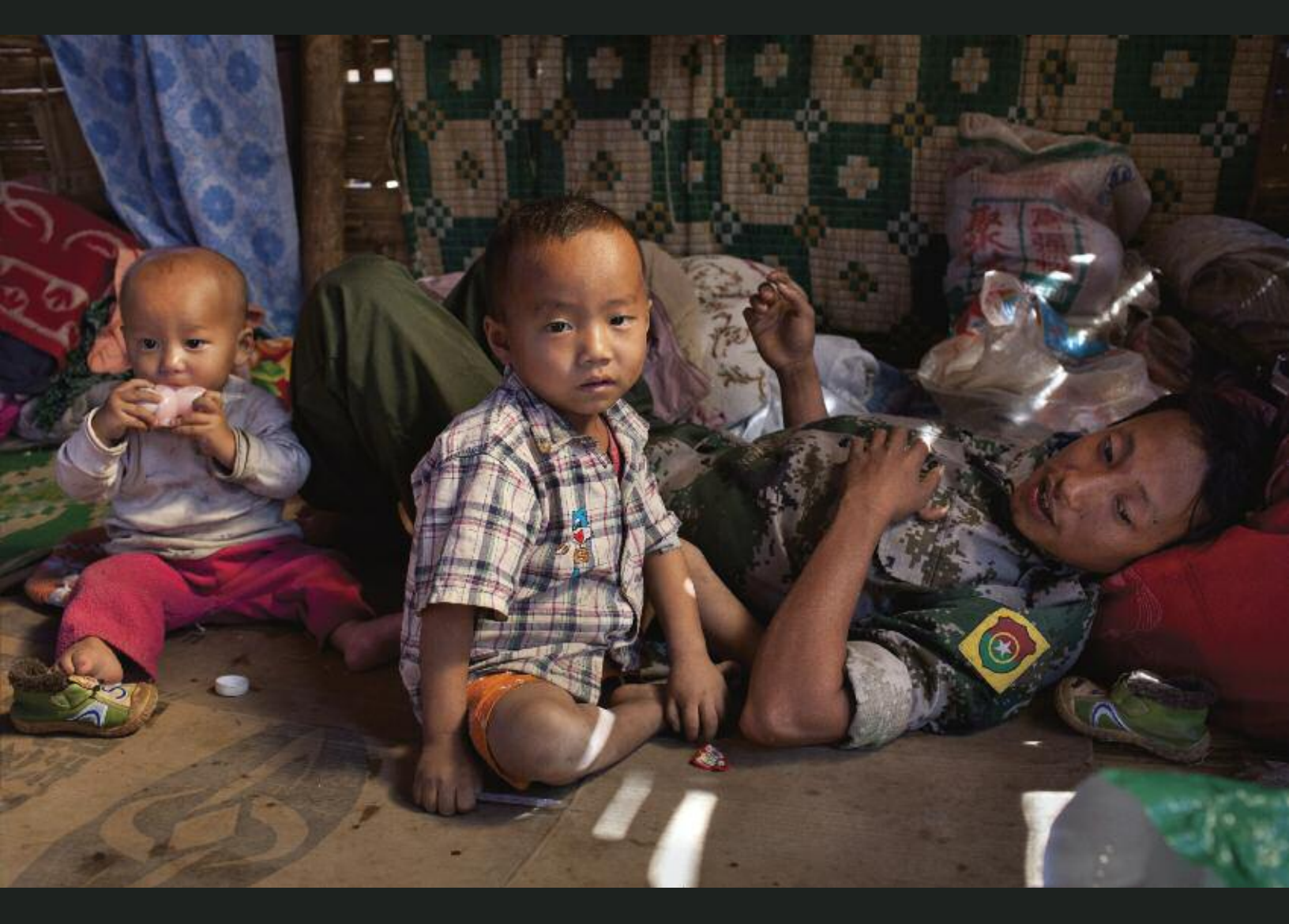
A KIA officer visits his displaced family at their temporary shelter outside Laiza, Kachin State, January 29, 2012.