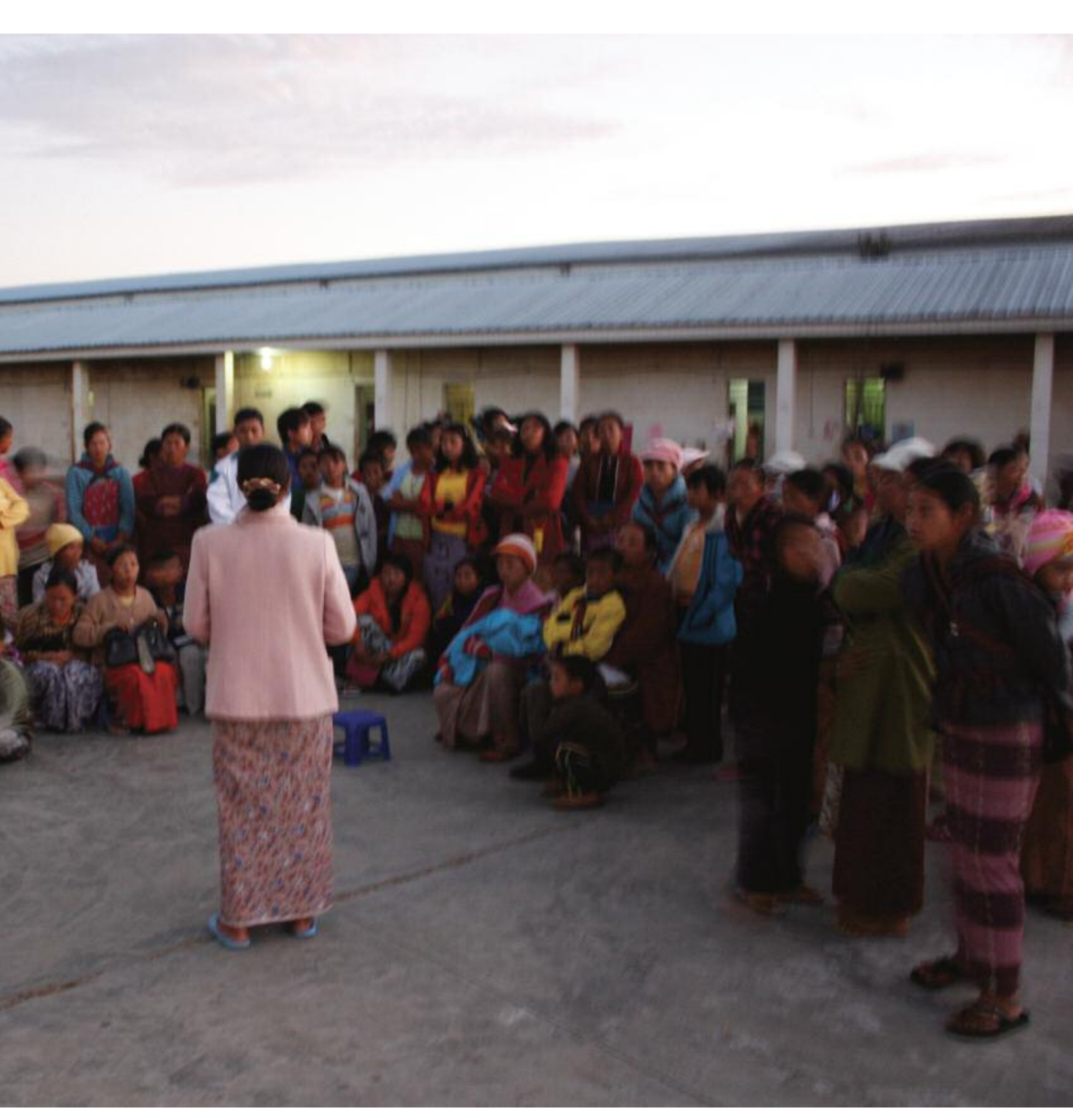
A female Kachin minister leads a group of displaced persons in prayer outside a makeshift IDP camp in Maijayang in the KIA's eastern division.