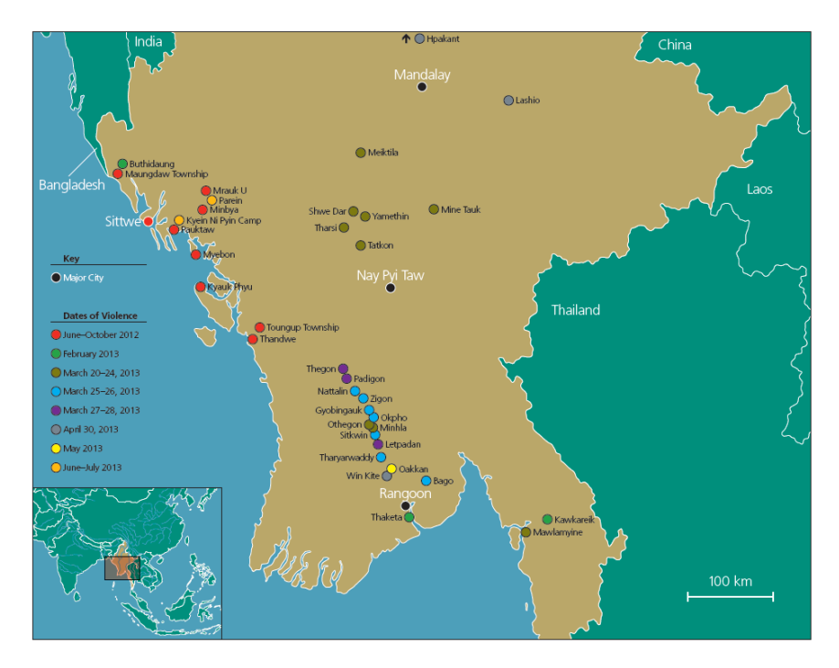
Sites of intercommunal violence June 2012 - August 2013.

Intercommunal violence in Myanmar has followed a geographical pattern during the transition period, taking place to a large extent in clusters of townships at different times. The violence began in Rakhine State between July – October 2012, before surfacing in Mandalay Divisions (and to a much lesser extent Mon State) between 20 – 24 March 2013, quickly followed by outbreaks in Bago, Yangon, and Ayewaddy Divisions in following days<sup>66</sup>. The number and frequency of violent incidents declined after March 2013, though incidents spread to other parts of the country including Shan and Kachin states (April 2013) and Saigang Division (August 2013). Violence also resurged in Rakhine State in Kanbalu township (October 2013) and in Daw Chee Yar Tan (January 2014).