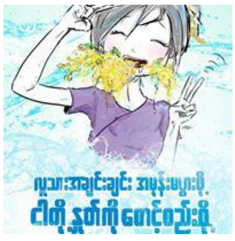
Logo of the Panzagar Campaign.

Though internet penetration remains very limited, particularly in rural areas, access will soon increase dramatically. So-called "love speech" campaigns include the Panzagar or "no dangerous speech" campaign, which attracted almost 10,000 Facebook followers in less than a month since its launch during the Thinjan festival 2014<sup>77</sup>. The campaign combines several elements which may have been instrumental in its popularity, namely combining highly visible offline events with intensive online multimedia campaigning, associating with notable personalities, and employing a meaningful and memorable symbolism (yellow Thinjan flowers in followers' mouths, to depict "love speech").