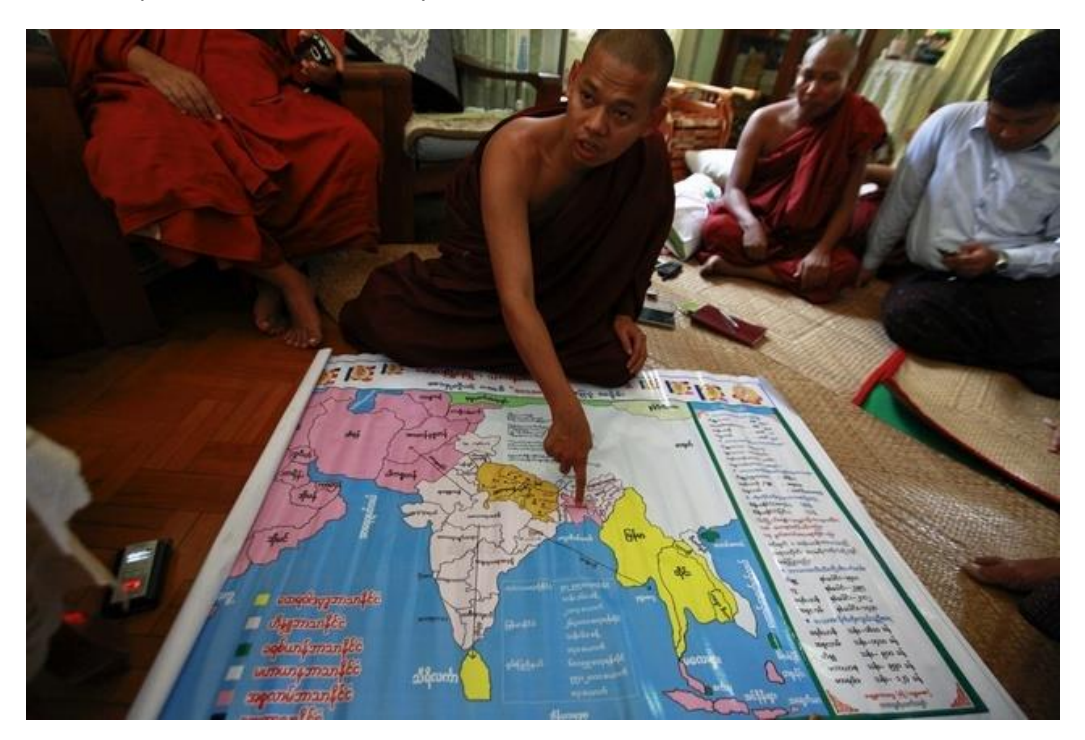
Buddhist monk points to Bangladesh on a map of dominant religions by country.

Fear of demographic besiegement is not limited to Muslims. It is widely recognised that Myanmar is bordered by the heavily-populated and non-Buddhist China, India, and Bangladesh. Unchecked immigration from China since the 1980s is estimated to have resulted in 2 million illegal Chinese immigrants living in Myanmar, which is contributing towards tensions between Buddhist and Chinese cities in places such as Mandalay<sup>13</sup>.