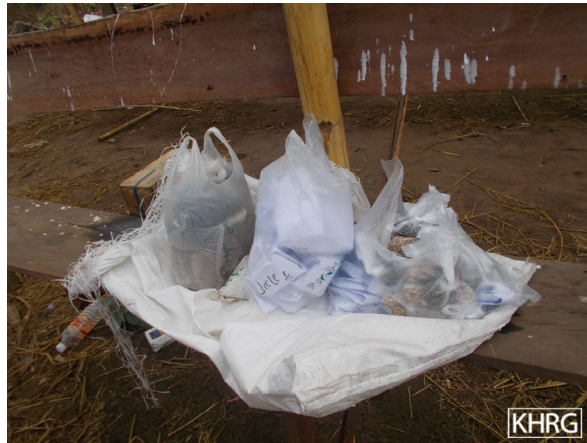
These photos were taken in March 2017 in Htee Nya Paw village, Noh T’Kaw (Kyainseikyi) Township, Dooplaya District. They show the farming equipment, seeds and anti-mosquito insecticide provided to returnees by Noh Poe camp’s agricultural department, who also conducted a short agricultural training to help them rebuild their livelihoods in Myanmar. Many of the returnees interviewed by KHRG received similar training.