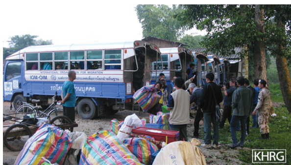
This photo was taken on October 26 th 2016 at Noh Poe temporary shelter in Thailand. These refugees, 71 in total, are the first group to have returned to Southeast Myanmar through the UNHCR tripartite agreement with the Myanmar and Thai governments. This photo shows the refugees leaving Noh Poe camp in the transportation arranged by IOM, the Thai government, and UNHCR.