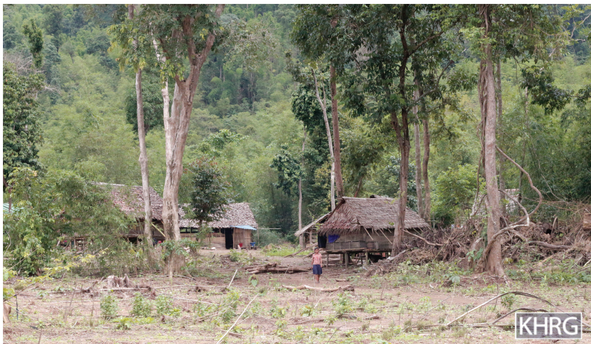
This photo was taken in Ma Yah Hpin village, Moon (Mone) Township, Kler Lwee Htoo (Nyaunglebin) District on June 24 th 2017. The photo shows houses in Ma Yah Hpin village, where IDPs have returned.