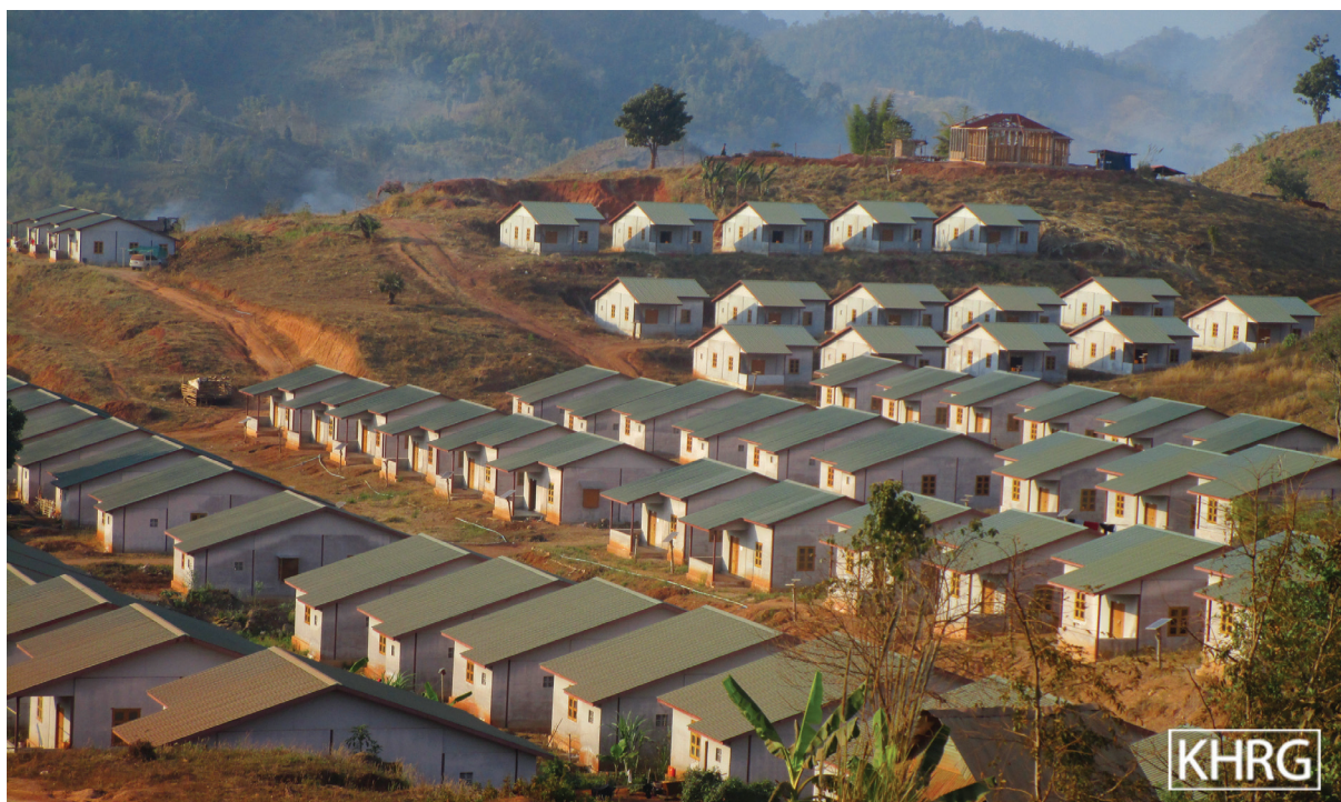
This photo is from a video taken of Kaw Lah village, Kaw T'Ree (Kawkareik) Township, Dooplaya District on February 6 th 2020. Kaw Lah village is one of several designated repatriation/resettlement sites for returnees. Pictured is the three hundred Houses area where new housing was built for refugee and IDP returnees.