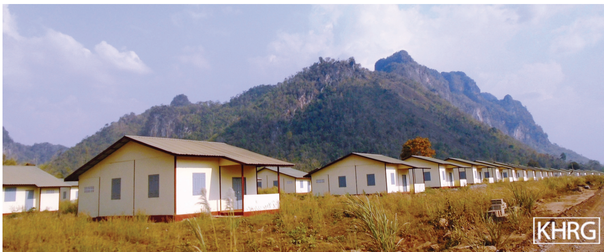
This photo was taken on February 26 th 2017 in the Lay Hpa Htaw repatriation site, Noh T’Kaw (Kyainseikyi) Township, Dooplaya District. They show the houses that were built for the repatriated refugees right after their construction. Even at that time, an interviewee from nearby Deh Ther Pler pointed out that the lack of farmland around the site will create problems for future returnees: “There is [we will get] only one house without land to farm for our livelihood. Therefore, where will we get food if we return to that area?”