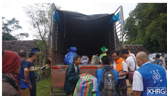
These photos were taken on May 8 th 2018 at Noh Poe temporary shelter. This marks the second repatriation initiative by UNHCR and the Myanmar and Thai governments. 93 refugees returned at this time.