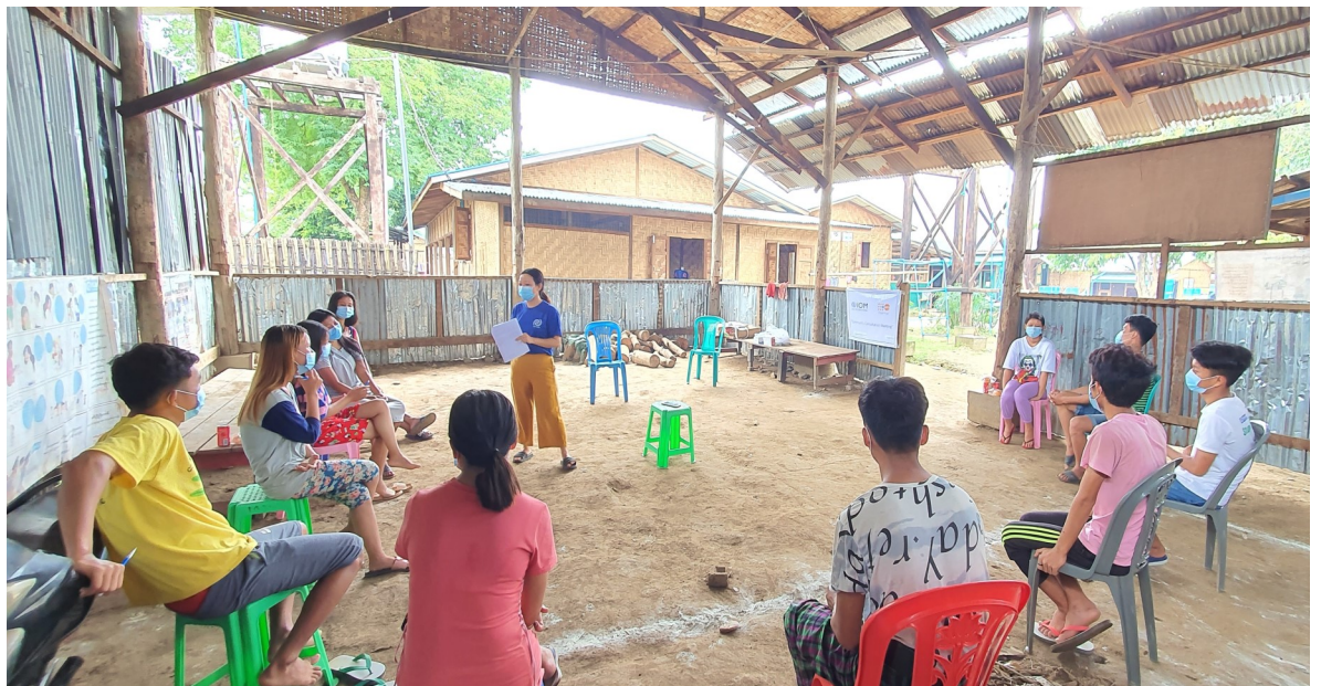
Community consultation meeting with youth at Bethlehem Baptist Church IDP camp in Myitkyina, Kachin State.

from China through border checkpoints from 15 June to 2 July