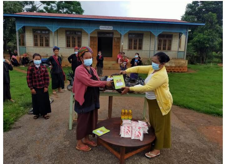
Taunggyi MRC staff providing food support to migrant women in Kauku, Shan State.

As one part of the broader IOM COVID-19 response, IOM's Migrant Health Programme is working closely with local and regional authorities to provide targeted COVID-19 assistance around the country, including supporting health care messaging through loudspeaker announcements in urban areas where positive cases have been found in Maungdaw Township, northern Rakhine State. IOM is also supporting Township Health Departments for contact tracing at Kye Hnote Thee Village in Maungdaw, and the distribution of masks and soap, purified water for hospitals and isolation facilities, and COVID-19 IEC materials. IOM is also assisting with the distribution of face masks for quarantined ethnic minority groups (Mro and Dynet) at community quarantine centres in Myo Thugyi Rural Health Centre and supporting the installation of partitions in isolation wards at Maungdaw Hospital. IOM is providing per diem, food, personal equipment and hygiene kits to COVID-19 positive patients hospitalized in Maungdaw and Buthidaung hospitals, as well as nutrition support for HIV positive migrants returning from Thailand to Mawlamyine Township in Mon State. Testing booths supported by IOM are playing a crucial role in collecting swabs of people under investigation in Kachin, while in Kayin, IOM is supporting the renovation and installation of an isolation ward in Myawaddy Hospital with the purpose of creating a hospital quarantine.