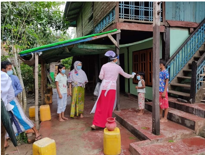
House-to-house fever screening in Kyein Chaung Village, Maungdaw Township, Rakhine State.

WFP and its partners are providing food assistance sufficient for 55,000 returning migrants placed under quarantine in Kachin, Kayin, Mon and Shan states; as well as Bago, Magway, Tanitharyi and Yangon regions.