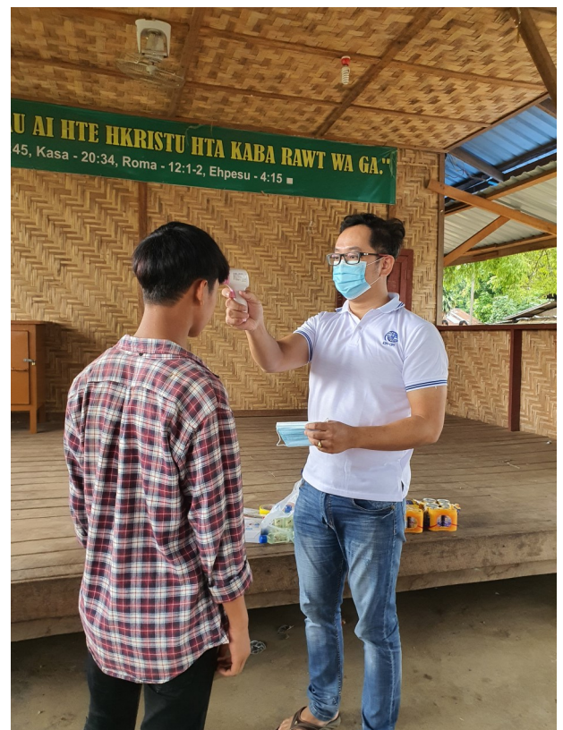
Fever screening and surgical mask provision before community consultation meeting at Ziun IDP camp, Myitkyina, Kachin State

At a press conference on 26 June, the Deputy Minister for Labour, Immigration and Population estimated that the number of jobless Myanmar workers, including migrant workers, reached 250,000 in June. The number of unemployed workers includes 140,000 workers previously employed in the 5,658 factories in Myanmar that shut down due to COVID-19.