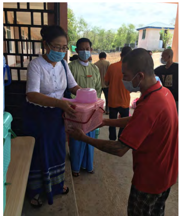
Distribution of WASH consumable kits to returning migrants in Dawei, Tanintharyi Region.

131 migrants also returned from Lao PDR through Won Pang checkpoint in Shan State, on 8 May.