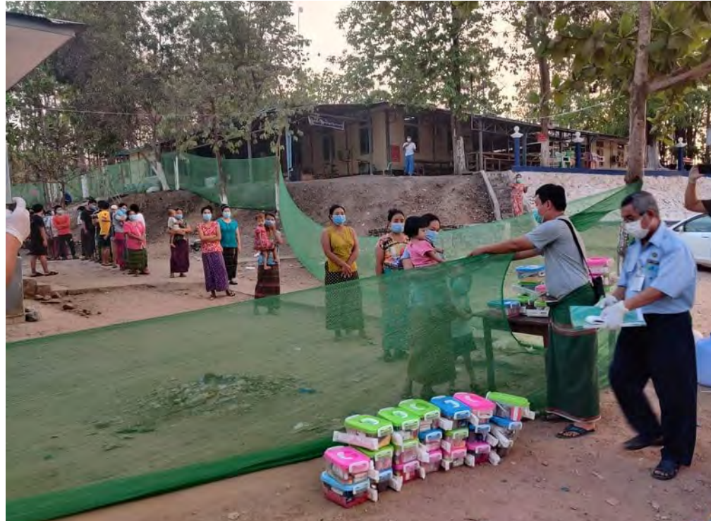
Distribution of WASH consumable kits to returning migrants quarantining for 21 days at a quarantine facility in Myawaddy, Kayin State.

through Kan Paik Ti and Lwegel border gates in Kachin State