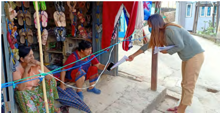
IOM partner, Chin Human Rights Organization (CHRO), distributing COVID-19 risk communication IEC materials in Chin State.

IOM continues engaging with State Health Departments to support the COVID-19 response , and in Kachin, IOM is distributing testing booths to all official points of entry to support Government health teams' COVID-19 testing. IOM has also provided 200 PPE sets, including surgical gloves and gowns, to public health authorities in Kachin, and it is currently supporting the renovation of an isolation ward at Lwelgel to support migrants returning from China. IOM and CSO partners continue the distribution of hygiene kits, PPE items, and WASH kits to quarantine facilities (QFs) and health centres, and reached 14,591 returning migrants and members of migrant-sending communities in Chin, Mon and Kayin states, from 4 to 10 May. Community awareness-raising activities also continue, and IOM and CSO partners reached an estimated 156,559 members of migrant-receiving communities in Chin State and Magway and Mandalay regions with COVID-19 risk communication messages via loudspeakers on cars, from 4 to 10 May.