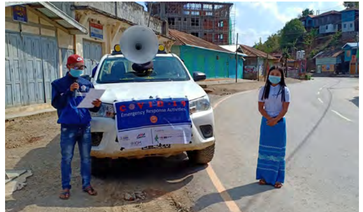
IOM partner, Chin Human Rights Organization (CHRO), disseminating COVID-19 risk communication messages via loudspeaker.

QFs in 39 townships in Shan; supporting the Shan State Minister to develop a costed plan for migrant workers returning from China; and providing IEC materials on home quarantine guidelines and COVID-19 protection to migrants returning to Kayin.