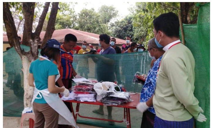
IOM staff and Migrant Resource Centre Counsellor distributing assistance to returning migrants at Kyauk Lone Gyi Quarantine Centre in Myawaddy, Kayin State.

to facilitate the movement of Myanmar migrants from Bangkok to Mae Sot, is being prepared, and it will consist of 10 buses per day with a capacity for 21 people per bus (210 returnees per busload). The first busload of 210 migrants returned safely, arriving in Myanmar on the morning of 23 May.