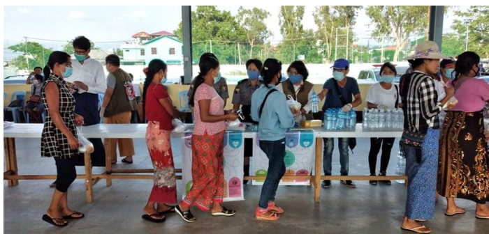
ILO partners distributing water and food to migrants who arrived from China, in Keng Tung, Shan State.

Returns from China continue, with a total of 21,291 returns from 16 April to 21 May, according to data from the Department of Labour (DOL). The major entry points were in Kachin and Shan states, with most returns from China in May occurring through Nan Taw, Chin Shwe Haw and Mongla border crossings in Shan State.