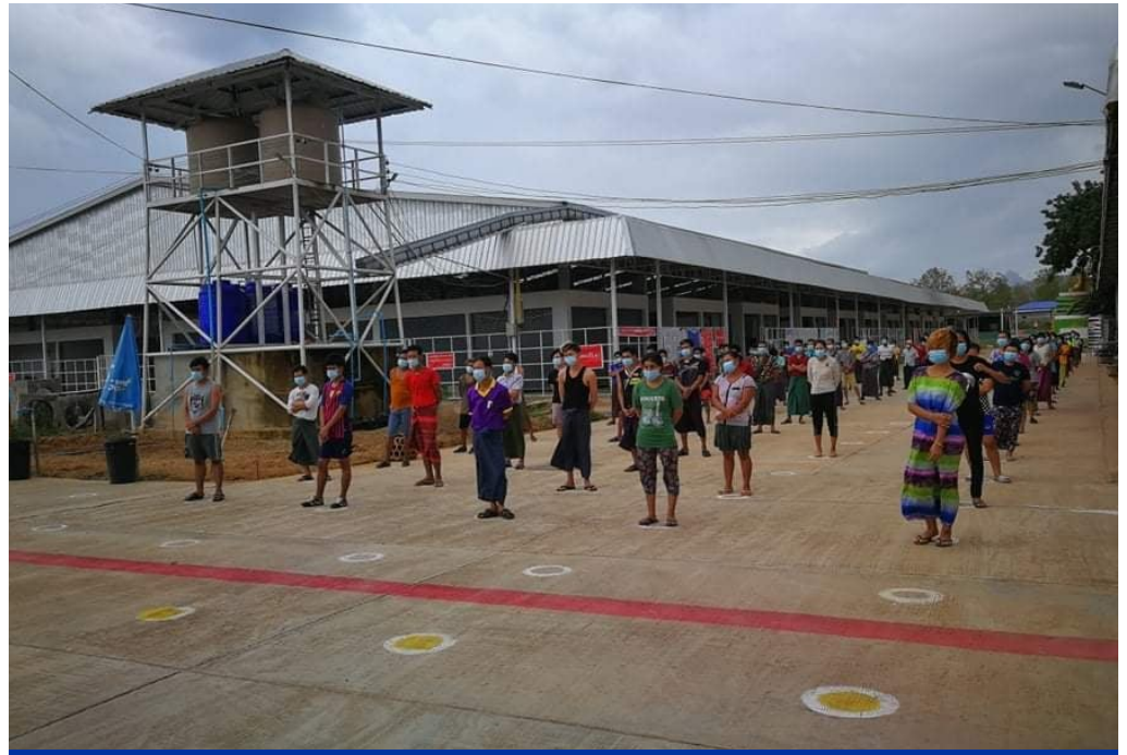
Migrants practicing social distancing during a COVID-19 risk communication session at Shwe Myawaddy Quarantine Centre in Kayin State.

From 1 to 9 May, mainly through border checkpoints in Kayin State