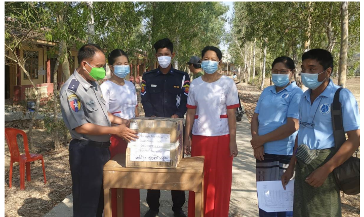
IOM CSO partner, Swan Saung Shin (SSS), distributing COVID-19 response items to health staff supporting migrant-sending communities in Labutta Township, Ayeerwady Region.

centres in Kayin State (440 in Myawaddy and 15 in Hpa-An) and in May provided 3 cooked meals a day. In northern Shan State, WFP is providing food provisions, including meals at points of entry for 4,150 people, including 3,000 people in quarantine facilities. To date, WFP has provided food assistance sufficient for the needs of 12,700 returnee migrants in Yangon, Kayin, Mon and Shan State, while also planning food and nutrition assistance to returnees in Kachin State.