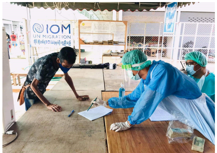
Migrant signing up for travel cost support to return to his home community after quarantining near Myawaddy following return to Myanmar.

several townships across the country, including in Rakhine State (27 August to date), Yangon (2 September to date); Mon State, Mandalay, Bago and Ayeyarwady regions (26 September to date); and Kachin State (20 October to date) remaining under Stay at Home orders. Although concrete data is unavailable, the restrictions have affected large numbers of internal migrants' access to livelihoods and incomes, as well as protective and health services .