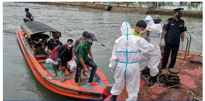
ILO CSO partner, Foundation for Educational Development, receiving returning migrants at Kawthaung, Tanintharyi Region.

The mask making initiative for dismissed factory workers organized by the Yangon Chi Workers Association supported by the ILO "Developing International and Internal Labour Migration Governance in Myanmar" project has produced and donated 21,396 masks (4,000 to Yangon and Mandalay COVID-19 Committees, 14,996 to garment workers in factories, and 2,400 to quarantine centres in Shwe Pyi Thar). ILO-supported Migrant Centres also continued to deliver care packages, COVID-19 information as well as safe migration information, reaching 10,324 returning migrants and members of migrant-sending communities between 1 September to 14 October, bringing the overall total to 139,114 people (60,495 women, 78,624 men) reached since the start of the pandemic.