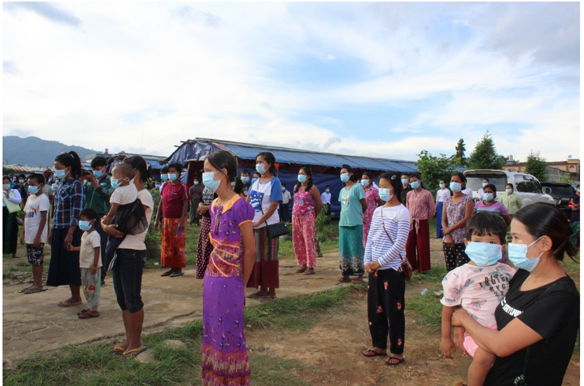
Returning migrant women and girls at a community-based quarantine facility in Lwegel, Kachin State.

through border checkpoints from 22 March to 21 October