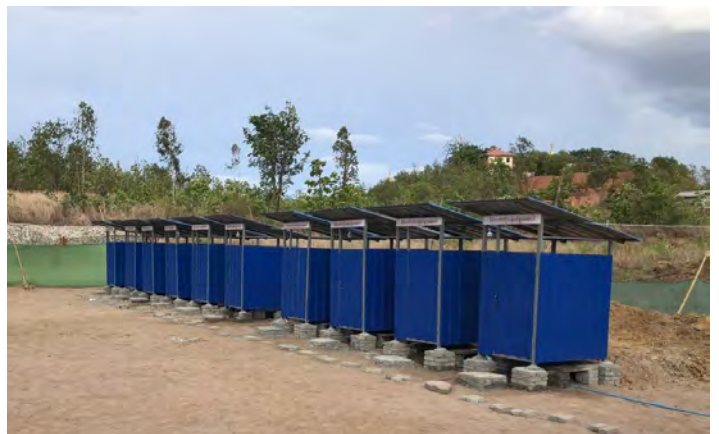
Latrines provided by IOM at a quarantine facility in Myawaddy, Kayin State.

Government during the process of applying for employment cards. PRAs are also required to communicate these regulations to respective Thai employers. Should PRAs not follow these instructions, DOL will revoke the license of the PRA concerned.