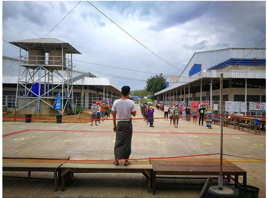
A COVID-19 risk communication session at Shwe Myawaddy Quarantine Centre in Myawaddy, Kayin State.

from 22 to 28 May, through Nan Taw and Chin Shwe Haw