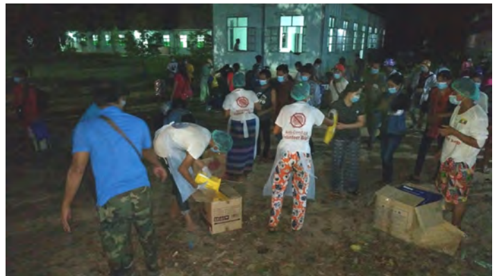
ILO CSO partner, Future Light Centre, distributing COVID-19 care packages to returning migrants and members of migrant-sending communities in quarantine in Bago.

UNHCR is providing COVID-19 related assistance in Kachin, Kayin and Kayah states, as well as in Bago and Tanintharyi regions. Specifically, as part of state level-support, UNHCR has handed over core relief items to the Tanintharyi Regional Government. Tanintharyi Regional Government's Minister of Social Affairs received 1,500 sets of bed sheets, pillows and pillow cases, sleeping mats, blankets and mattresses, 2,100 towels and 2,500 kitchen utensils and hygiene items to equip state-run QFs.