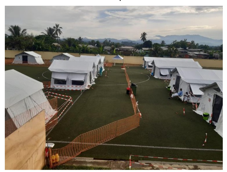
São Tomé e Principe, COVID-19 Treatment Center with 50 beds capacity built by Ministry of Health supported by WHO and Emergency Medical Team. May 2020. Jean-Pierre Veyrenche, used with permission.

In collaboration with WHO health operations and technical experts, assistance may also extend to providing recommendations for oxygen supply strategies and clinical care equipment, as well as training for medical and non-medical personnel.