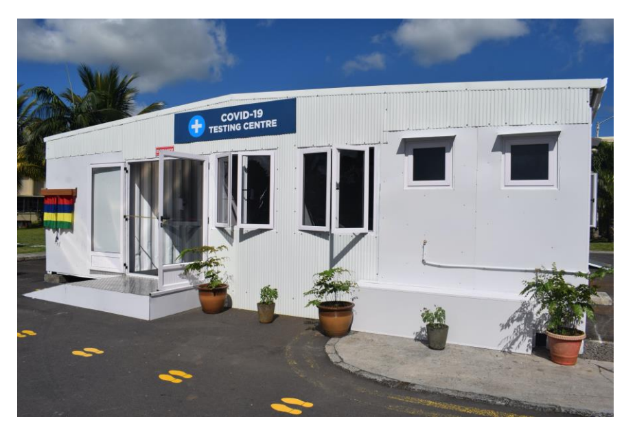
Mauritius, Screening facility with two isolation units in front Regional Hospital. Built by Ministry of Health and Wellness supported by WHO. Jun 2020.

Other ongoing WHO COVID-19 HelpDesk projects, include: collaborations with UNDP in Mozambique to redesign two laboratories to scale up testing capacity, repurposing an existing healthcare facility into a COVID-19 treatment center in Chad with the WHO Country Office; and setting up