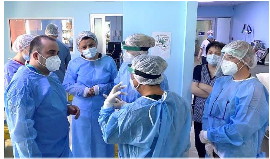
WHO experts and Georgian healthcare workers discuss infection prevention and control practices

Following a WHO expert mission conducted during the second half of August 2021, and upon the request of the Ministry of Health in Georgia, the WHO Health Emergencies