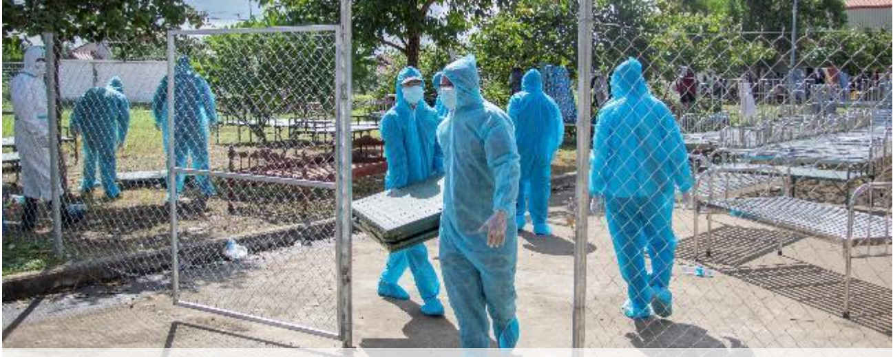
Frontline workers prepare the isolation facility.

Returning migrant workers receive medical care and support in Lao People's Democratic Republic