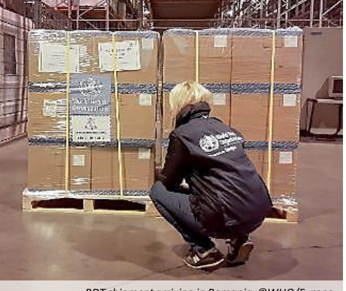
RDT shipment arriving in Romania, ©WHO/Europe

WHO teams deployed in Romania are focusing on both the critical short-term actions needed to reduce the COVID-19 morbidity and mortality and release the strain on the health system, and longer-term actions to strengthen Romania's continued response and increase the level of vaccine uptake, especially among at-risk groups where coverage remains low.