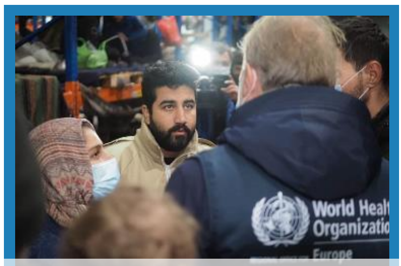
WHO/Europe team gathering information from affected populations at the Belarus borders

WHO/Europe also sent a team of Lithuania experts from 8-12 November to support the country in providing health care to migrants arriving from Belarus.