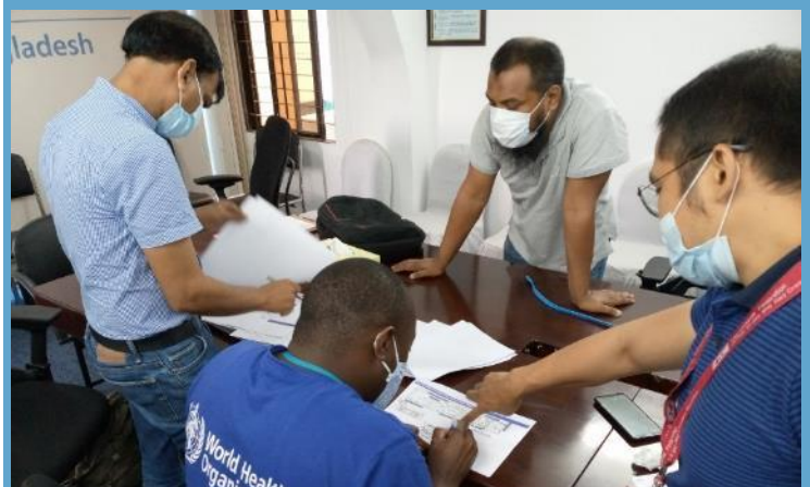
WHO reviewing drawings for IFRC/BDRCS SARI ITC plan May 2020