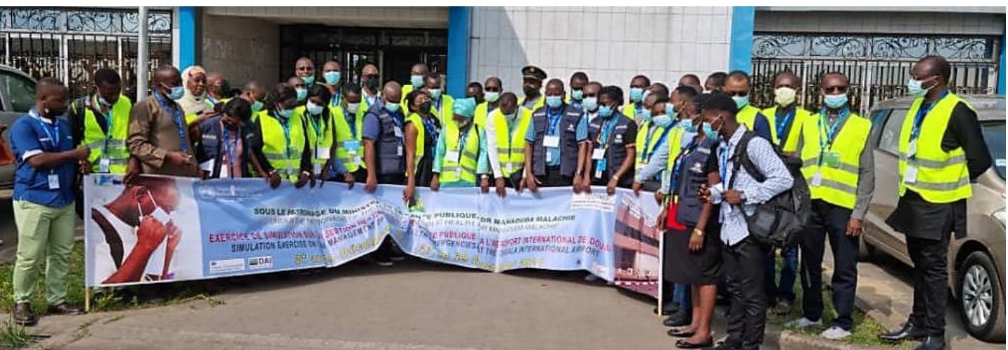
Group photo of the participants of the Doula International Airport PoE Simulation Exercise

Before the start of the Cup, the MoPH, with support from WHO, conducted a mass gatherings risk assessment to better inform operational planning and developed a health coverage plan in accordance with the Confederation of African Football (CAF) health requirements for major sports events. Due to the variant of concern, Omicron, the MoPH updated its RCCE strategy and tools based on the latest global guidance and scientific information.