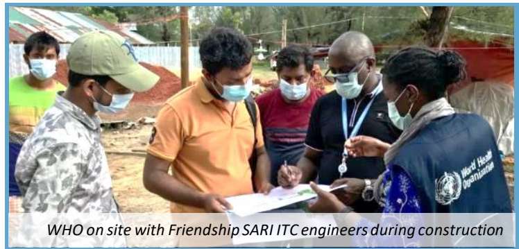
WHO on site with Friendship SARI ITC engineers during construction