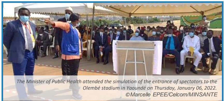
The Minister of Public Health attended the simulation of the entrance of spectators to the Olembé stadium in Yaoundé on Thursday, January 06, 2022.

Event organizers and the MoPH required all spectators to download a newly developed Sanitary pass digital platform , to collect and control the data on COVID-19 vaccination/testing in order to be admitted to event venues. The extension of the platform's functions, including integration with all national COVID-19 data, was identified by the MoPH as a necessity.