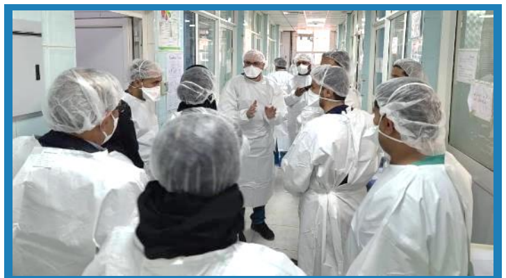
Mission members visiting the Al Kuwait isolation center in Sana'a, Yemen, in December 2021.

From 9 to 22 December 2021, WHO's Regional Office for the Eastern Mediterranean deployed an Infection Prevention and Control (IPC) expert alongside two experts from WHO Headquarters. The purpose of the technical mission was to support the country (WHO Country Office Yemen and the MoPH) in reviewing the IPC measures of response to the ongoing COVID-19 outbreak, identify and document strengths and areas of improvement, and provide recommendations to scale up the overall response.