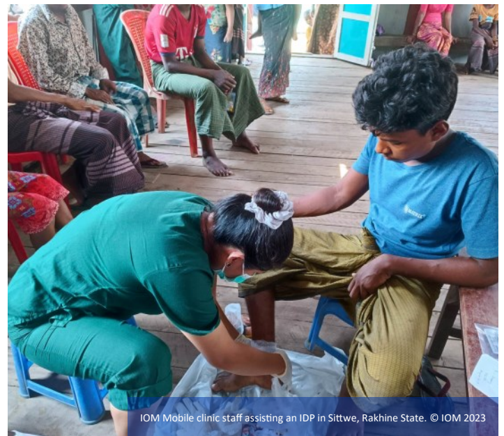
IOM Mobile clinic staff assisting an IDP in Sittwe, Rakhine State.

Rakhine —While the full impacts are still being ascertained, populations in Rakhine were already highly vulnerable. Already one of the most disaster-prone areas in Myanmar, the majority of villages in Rakhine are in low-lying parts of the coastline at risk of storm surge, while riverine communities are also highly prone to seasonal flooding exacerbated by deforestation. Hosting approximately 231,600 IDPs prior to the cyclone, the situation is particularly challenging in IDP camps and sites. Needs were already high for both Rohingya and Rakhine IDPs, with congested living conditions, lack of adequate site planning, limited WASH facilities, and health and protection risks. Field observations reveal extensive shelter damage, skyrocketing prices for critical shelter items such as tarpaulins, and rising needs for food and drinking water. Access to health services is also limited. Overstretched since 2021 due to the political and conflict situation, health services exist in some areas through mobile clinics and emergency health referrals; there is less coverage in rural communities and hard-to-reach villages. In addition, cultural barriers remain, limiting access to essential medical care and increasing health risks for women and girls. IOM teams on the ground observed significant damage to health infrastructure. Specific concerns were raised about the outbreak of water-related diseases which requires continued awareness-raising and direct response. Overall, the provision of