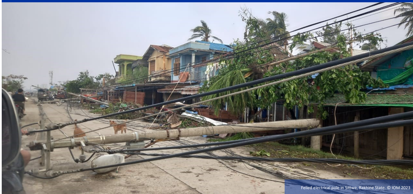
Felled electrical pole in Sittwe, Rakhine State.