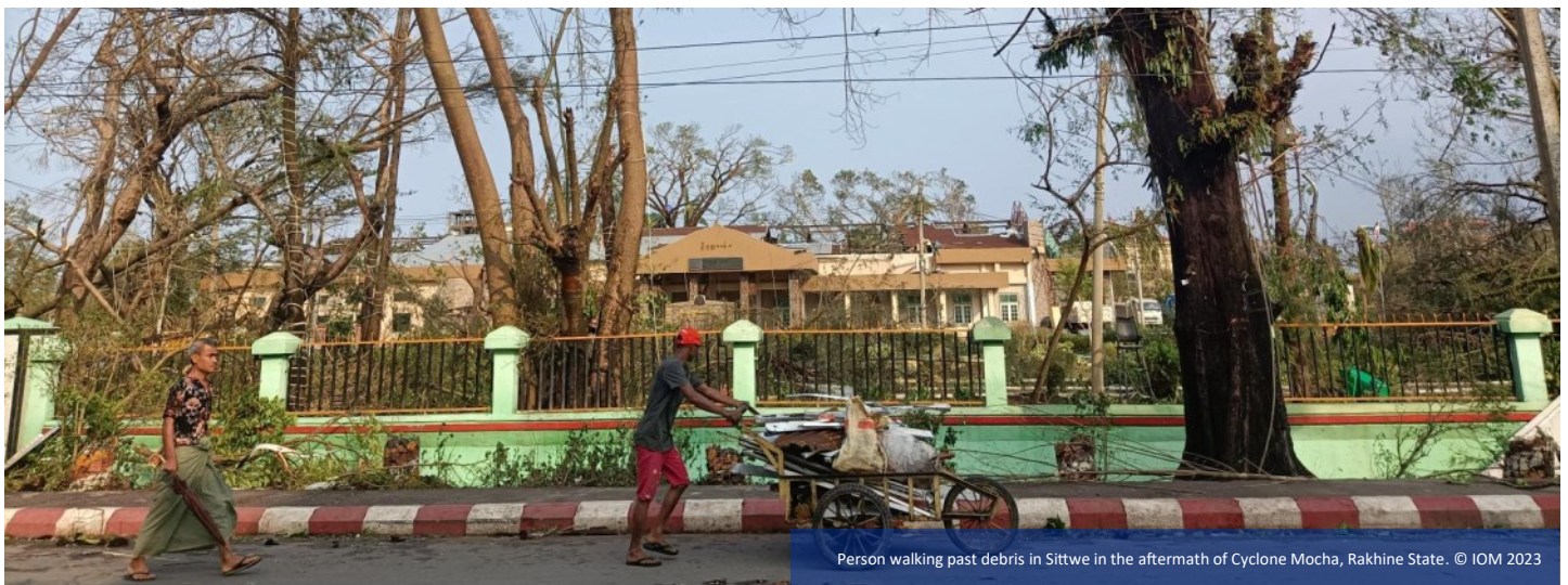
Person walking past debris in Sittwe in the aftermath of Cyclone Mocha, Rakhine State.

All IOM interventions mainstream protection, accountability to affected populations (AAP), prevention of sexual exploitation and abuse (PSEA) and conflict sensitivity, capacity building and technical support to local CSOs/CBOs and community-led initiatives, to increase sustainability and ensure a high degree of local ownership and influence in the design, planning and implementation of programming. As outlined in the IOM Migration Crisis Operational Framework ( MCOF ), IOM has a