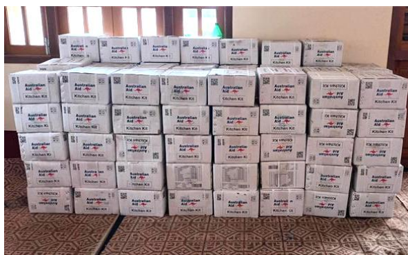
Kitchen sets donated by Australia waiting for distribution