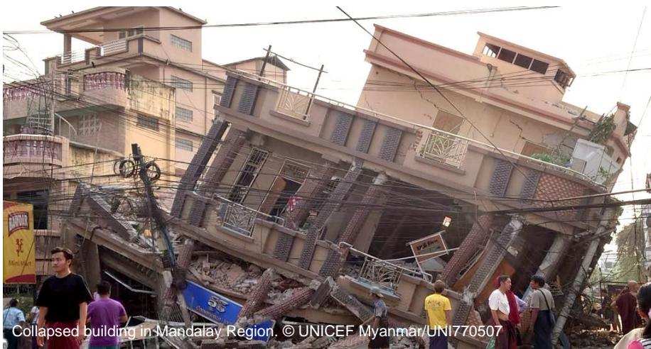
Collapsed building in Mandalay Region.