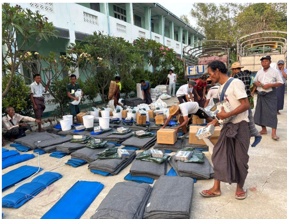
CRI distribution in Bago Region reaching earthquake-affected communities

To learn more about UNHCR's response in Myanmar, please visit the Operational Data Portal and Global Focus Reporting .