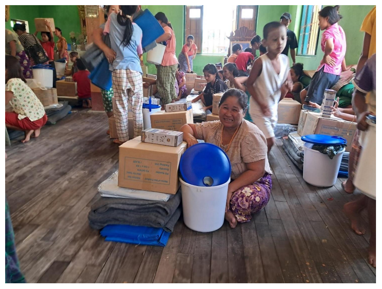
CRI distribution in Bago East Region reaching earthquake-affected communities

To learn more about UNHCR's response in Myanmar, please visit the <u>Operational Data Portal</u> and <u>Global Focus Reporting</u>.