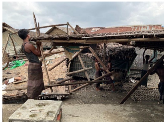
A shelter damaged by Cyclone Mocha that is being repaired in Nget Chaung 2 IDP camp. Pauktaw, Rakhine.

Millions of people live in the path of the cyclone and a massive effort is now underway to clear debris and provide shelter to those whose homes have been damaged or destroyed. Coastal Rakhine took the heaviest hit from the cyclone with severe impacts across the northwest and some damage in Kachin also reported. As of 16 May, authorities declared 21 townships across Rakhine (17) and Chin (4) to be impacted by the cyclone. Many areas in Rakhine are still deprived of electricity and reliable telecommunication services, more than four days after the cyclone hit.