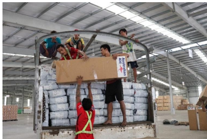
Australian-donated relief supplies being loaded onto a truck.