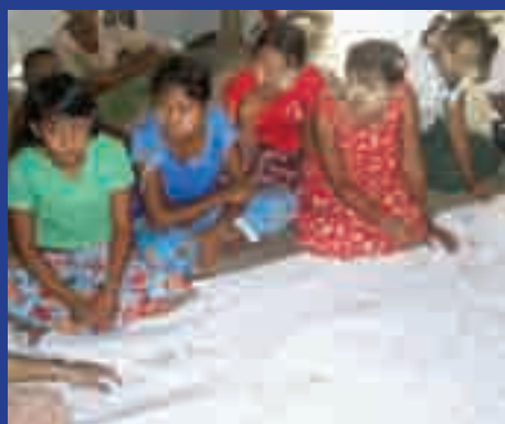
Children taking part in an exercise to seek their views on community based child protection