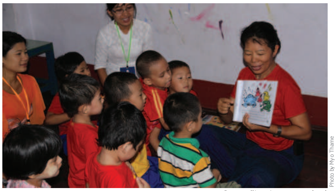
Story telling time at preschool