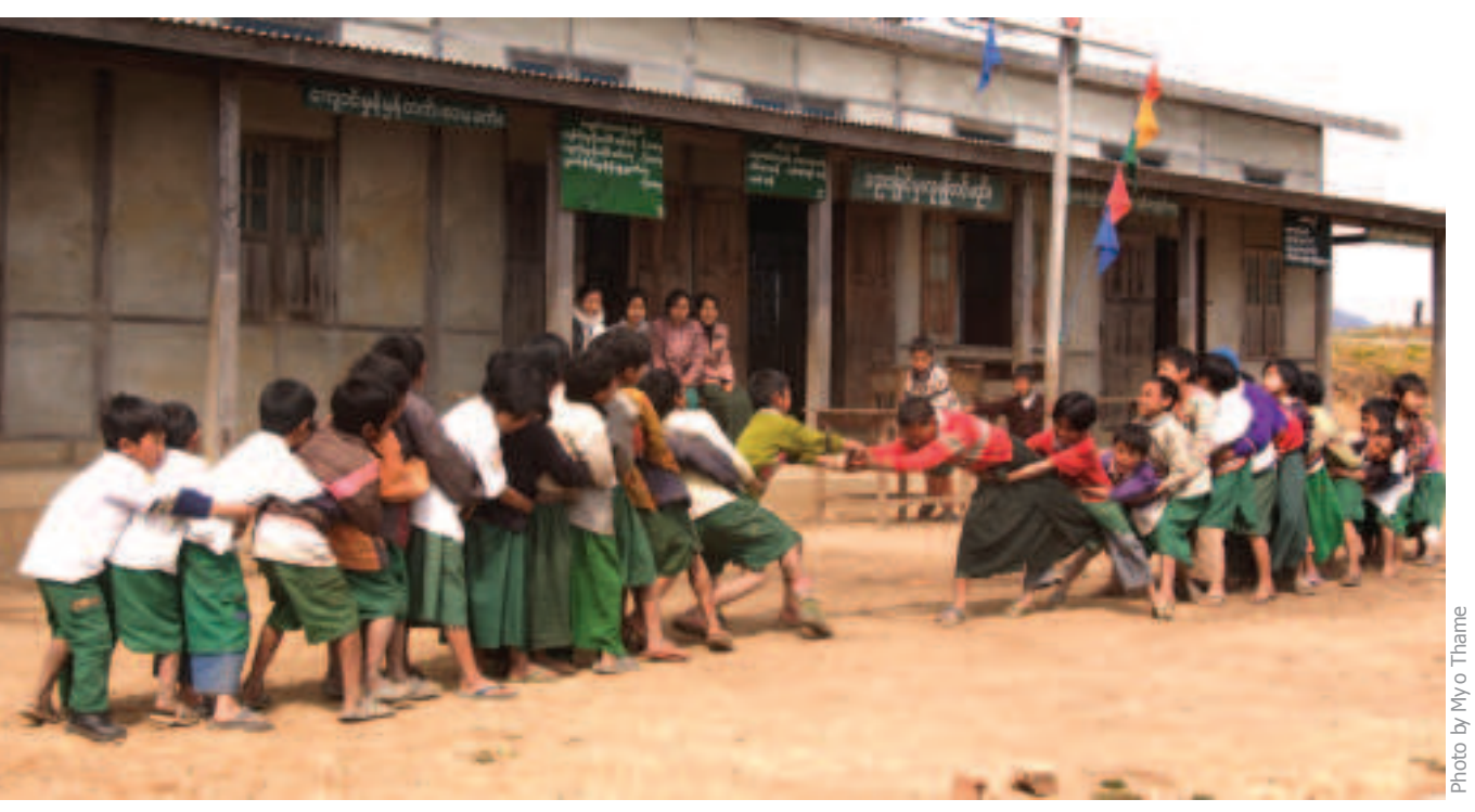
All children need to develop holistically