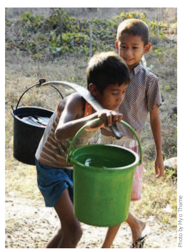
Abusive child labour must be ended

and school-age children. The next Plan of Action should include preventive, early intervention and inclusive preschool services that are presented in this ECCD Policy and its companion Five-Year Strategic Plan, 2014-2018. At present, a law is being drafted to protect the rights of persons with disabilities, and it too should include mandates presented in this Policy for ECCD services for children.