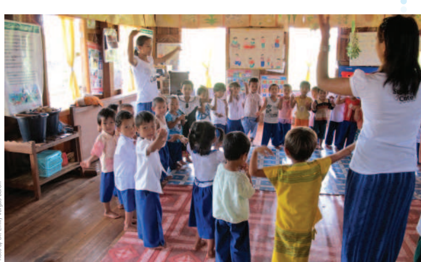
Large group activity in preschool, Nyaung Shwe