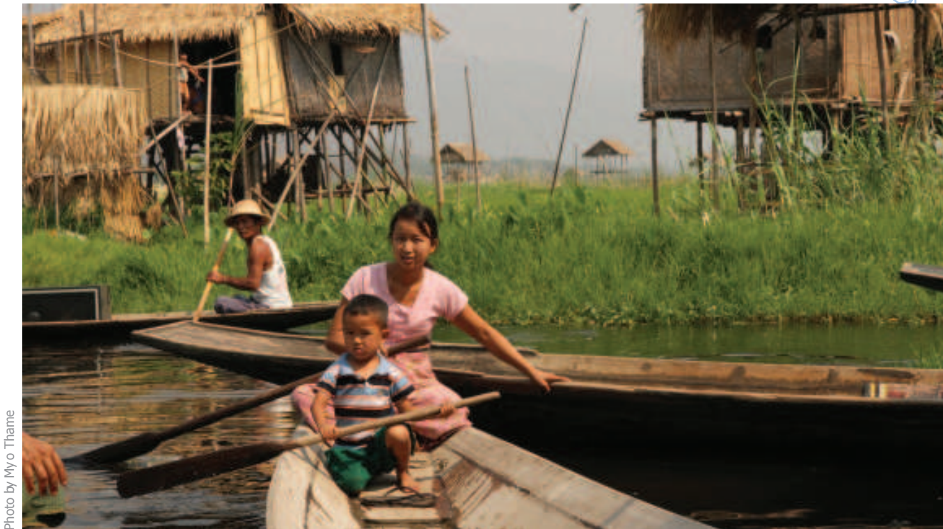
Children in Inlay lake