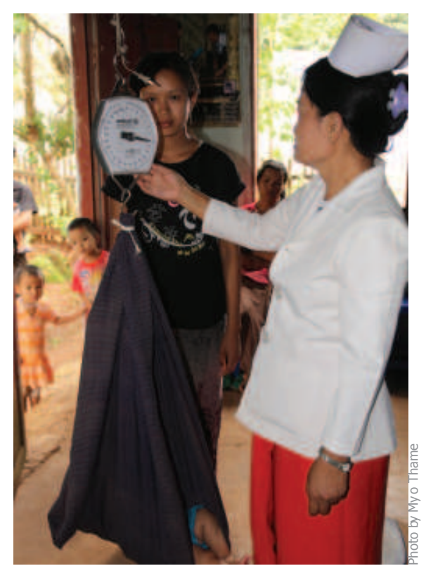
Regular growth monitoring for early intervention

and eventually eliminate child malnutrition and strengthen its efforts to promote exclusive breastfeeding until six months of age by raising awareness of health personnel and the public on the importance of exclusive breastfeeding." (United Nations, 3 February 2012).