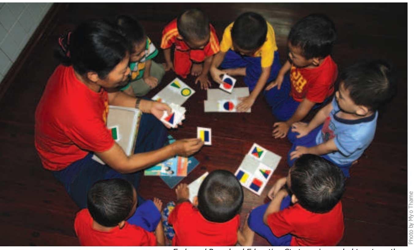
Early and Preschool Education Strategy is needed to strengthen Developmentally Appropriate Practices