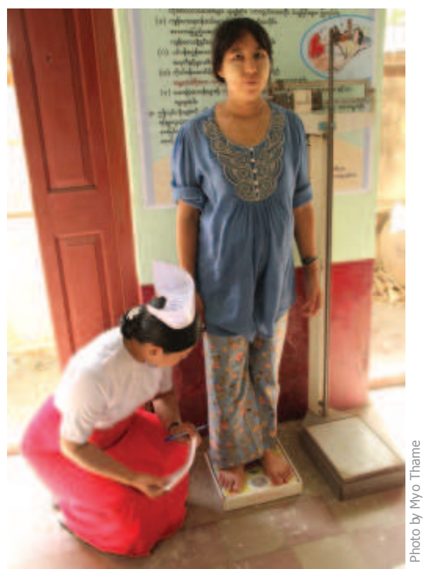
AN Health Care visits are for ALL pregnant women