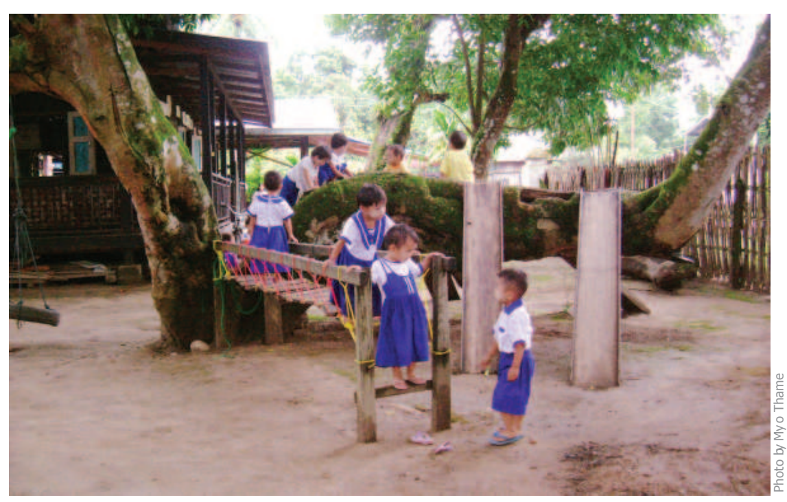
Community ECCD committees help establish preschools and other ECCD services

404. Each community will form a Community ECCD Committee with the Ward/Village Tract Administrator as Chair and the Principal of the nearby primary school as Secretary. The Committee will include people such as community leaders, heads of hamlets,