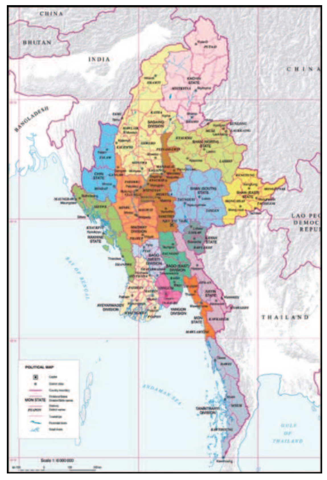
Map of The Republic of The Union of Myanmar