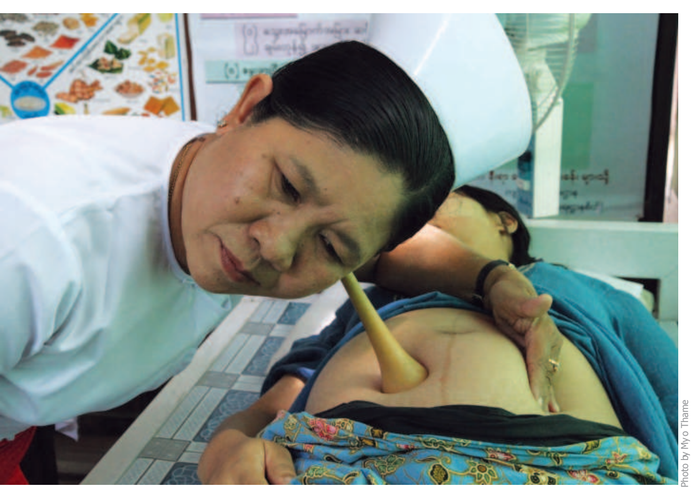
Antenatal education and health care visits are very important for having a healthy baby