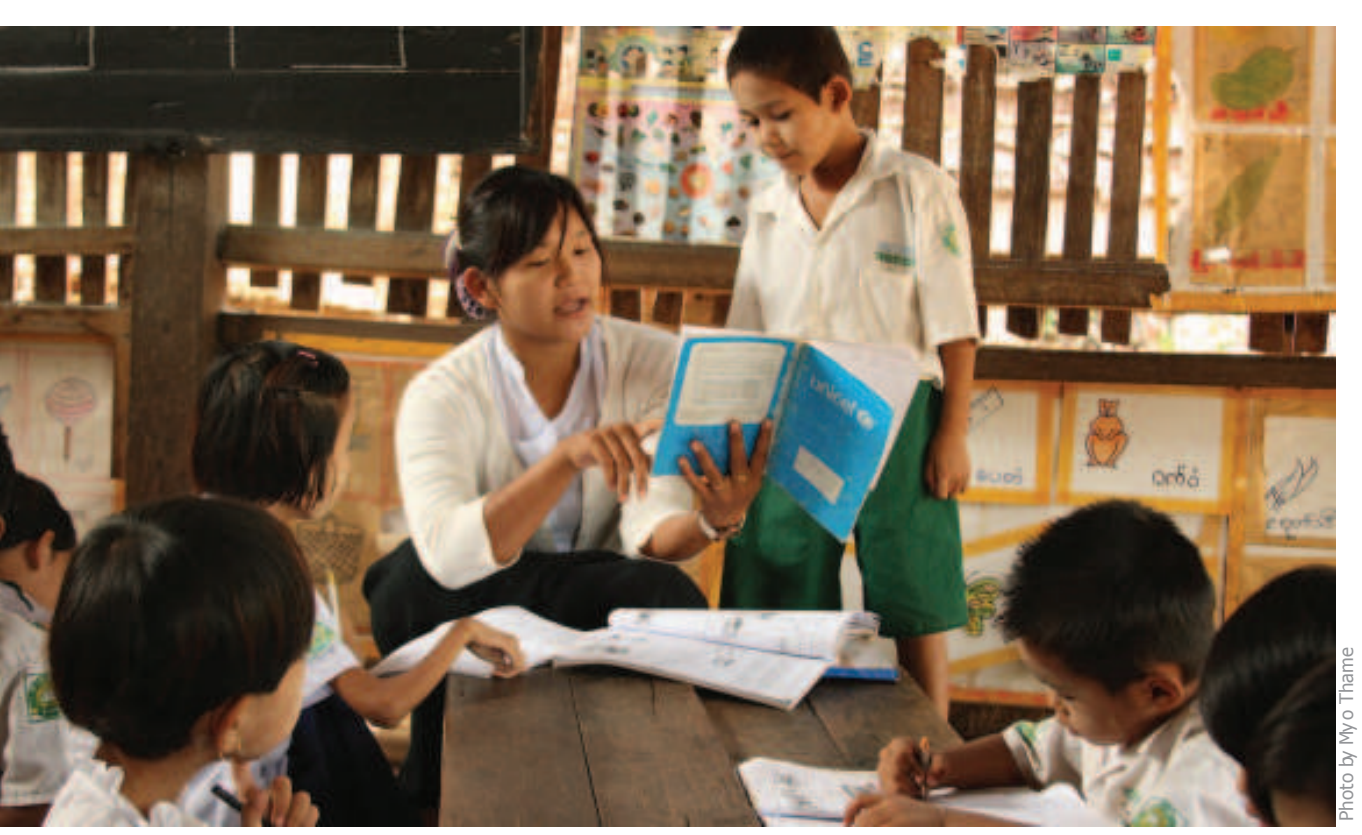
Learning in small groups in primary school