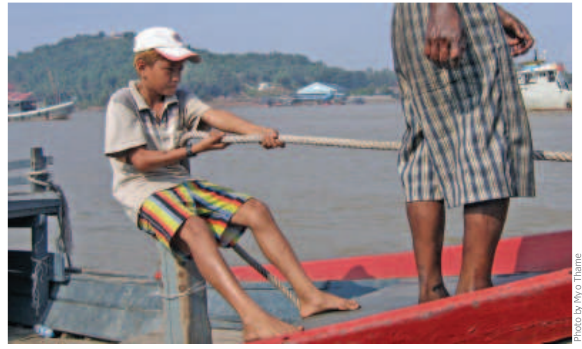
Children should receive essential protection services

are underway to develop child protection services in Myanmar, including the establishment of a Country-wide Child Protection Initiative (UNICEF, 2011a).