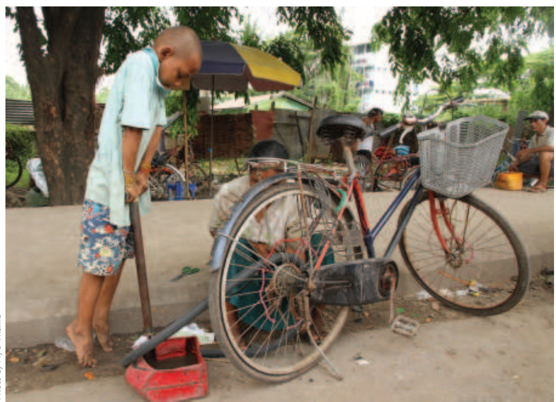
Poor families need support to send their children to school

64. Child protection has been the object of considerable work yet many children lack adequate protective services. Data are scant regarding the prevalence of child abuse, neglect and exploitation, children of parents in correctional facilities, children affected by violence, and young children forced to engage in abusive child labour. Many of these children go unidentified and receive little counselling or support. Major efforts