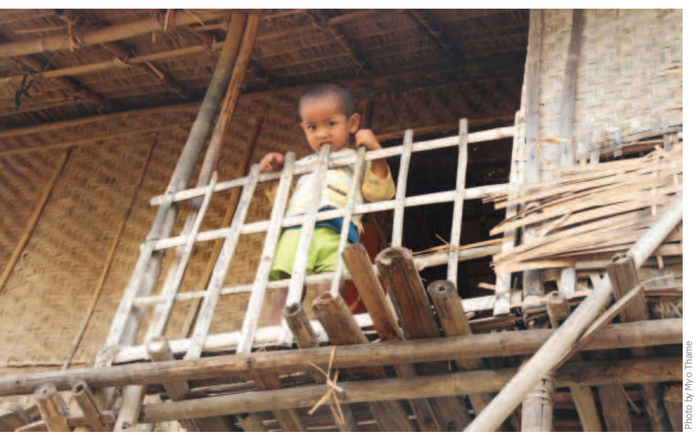
child safety need to be improved