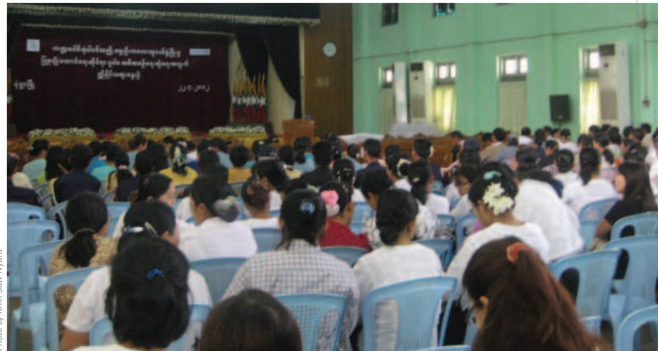
Broad-based participation in policy devolopment helps ensure policy implementation Consultation Workshop for ECCD Policy, Monywa, 2012