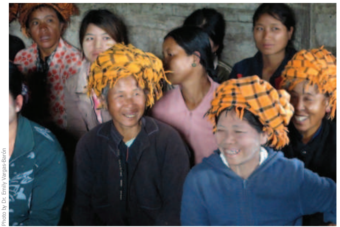
Pa-oh women actively participate in ECCD activities, Pinlaung Township