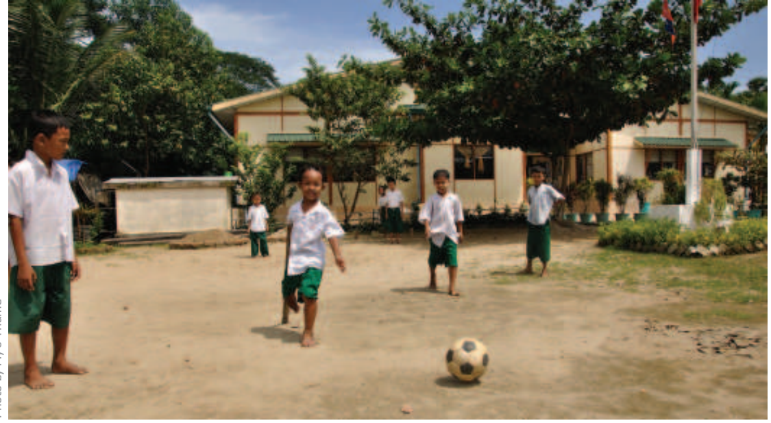
Inclusive primary school