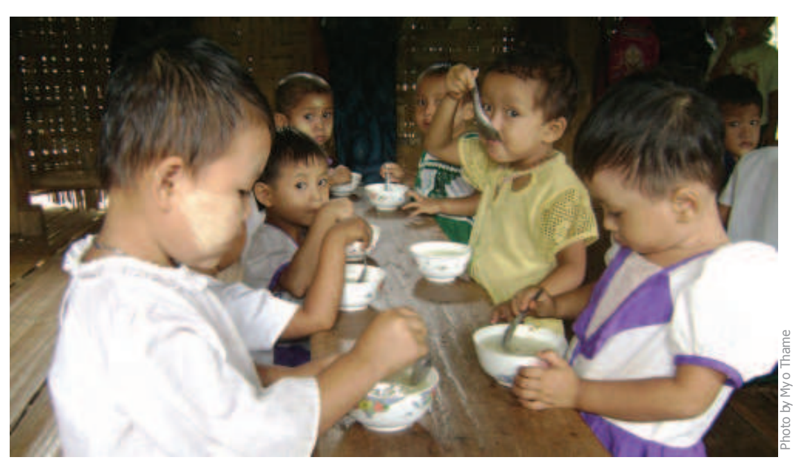
School breakfast and lunches are essential

54. Children exhibit high rates of malnutrition in Myanmar. WHO composed the following chart on child malnutrition using survey statistics for 2009 – 2010 for children from 1 to 4 years of age (WHO website, 2012).<sup>4</sup>