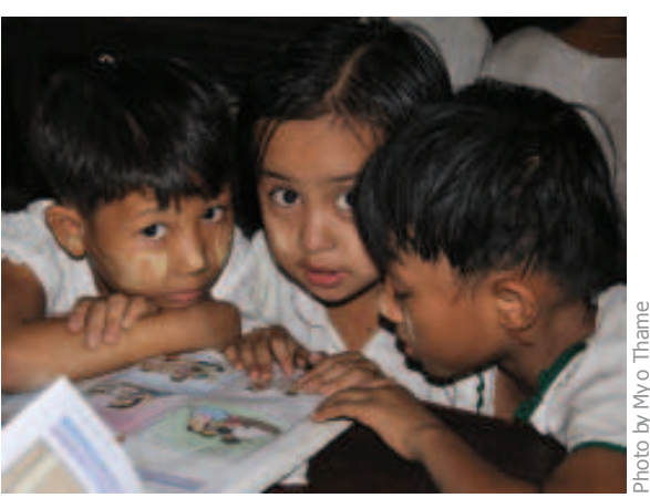
Getting ready for primary school

39. The high rates of internal inefficiency of the formal school system are caused in part by the lack of sufficient provision of high-quality ECCD services,