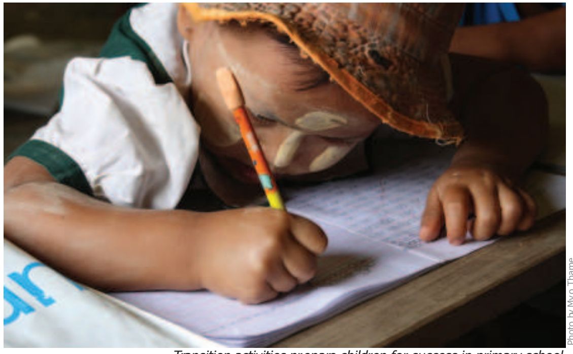
Transition activities prepare children for success in primary school

266. A baseline study has been conducted on transition activities in Myanmar (Thein Lwin, 2011). Although transition activities currently exist in Myanmar, a fully national programme for improved transition from home or preschool to kindergarten and primary school has not been developed as yet. As the nationwide transition programme is developed and implemented, each 5 years successive reviews of transition activities will be conducted regarding progress achieved, challenges faced and areas for growth and improvement.