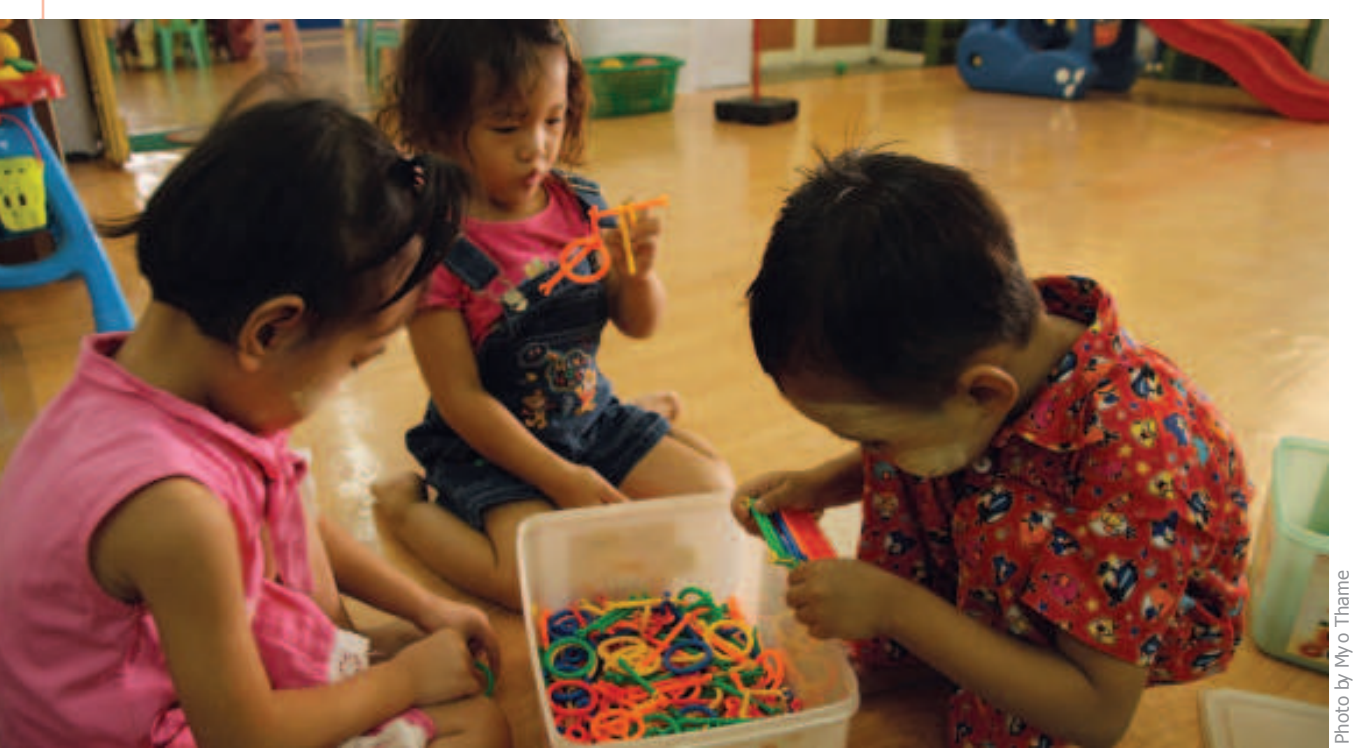
Quality preschool is for ALL children