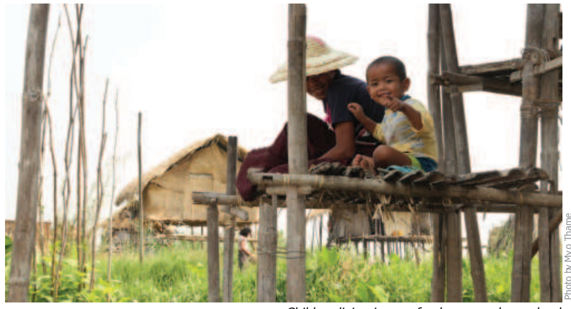
Children living in unsafe places need preschool