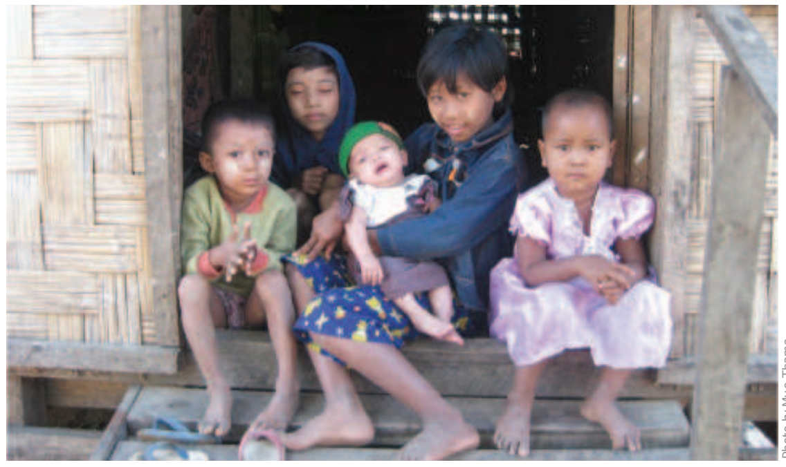
Malnourished children living in poverty need our help