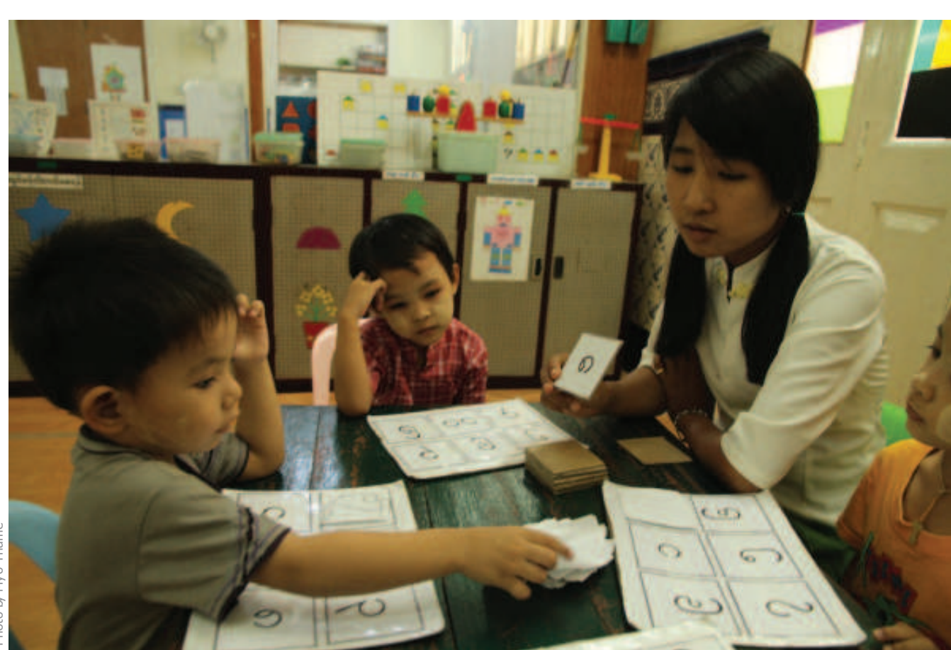
Learning my numbers