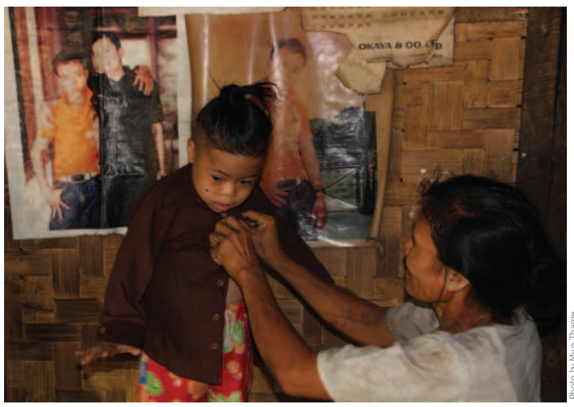
Parents play essential role in helping children with developmental delays