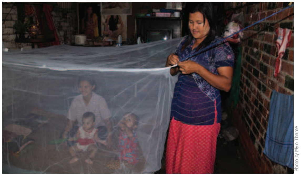
Protect mother and children against malaria by using impregnated and treated bednets

per centof children under 5 years of age. (MoH, 2011c). In 2011, the overall mortality rate was 1.2 persons per 100,000 population. These high rates of morbidity and mortality are especially of concern because infants and children can develop life-long health issues as a result of contracting malaria, and drug-resistant forms of malaria are now more prevalent in Myanmar (MoH, 2012a).