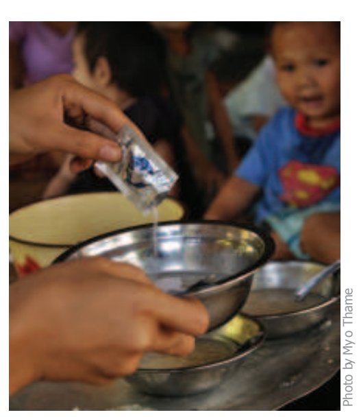
Micronutrient sprinkles for good nutrition

53. According to the MoH, Myanmar had a 7.9 per cent rate of low birth weight infants (<2,500 grams) in 2009 (National Nutrition Centre, 2009). MICS 2010 reports 8.6 per cent of infants were low in birth weight. These statistics do not include the many infants who were born at home. Those infants are the ones most likely to be low in birth weight. All low birth weight and pre-term infants require intensive and individualised early childhood intervention services to attain normal weight and typical developmental levels as quickly as possible.