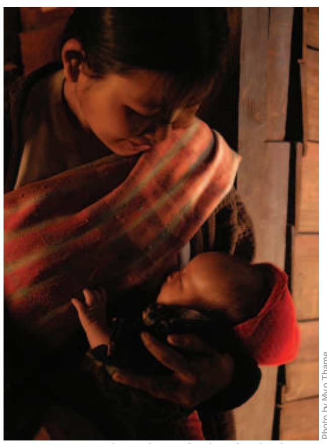
Exclusive breastfeeding for the first six months of life

204. For mothers working outside of the home, it will be important to ensure they receive enabling and accessible services for breastfeeding, health and nutrition, including afterwork opportunities for health care. Work-site facilities for breastfeeding mothers will be provided. Balanced and appropriate maternal nutrition will be emphasised, along with the provision of micronutrients as needed. Education will be provided regarding the avoidance of contrainsubstances dicated while breastfeeding, such as alcohol, smoking, damaging chemicals used in cleaning products, etc.