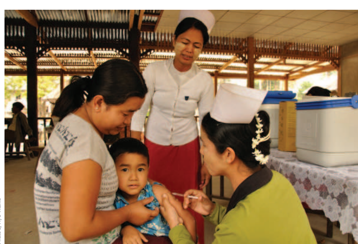
Immunisations protect me from illnesses