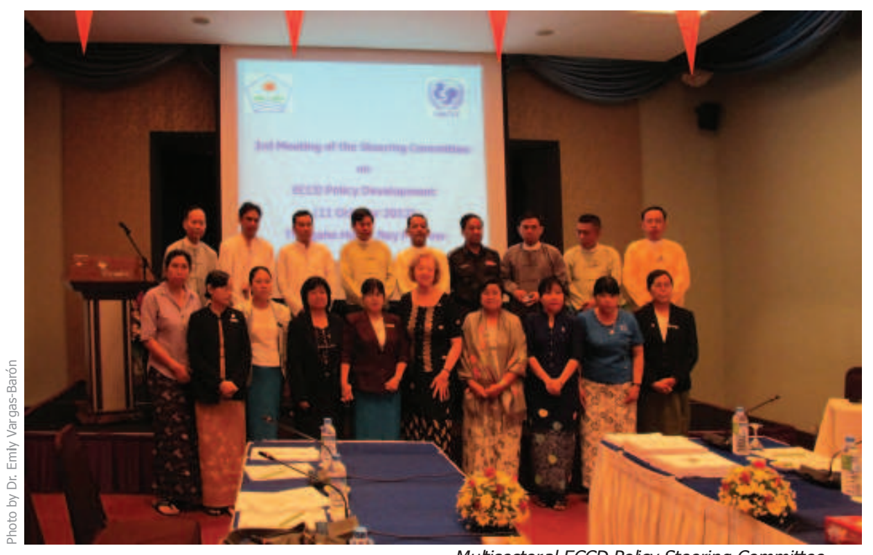
Multisectoral ECCD Policy Steering Committee