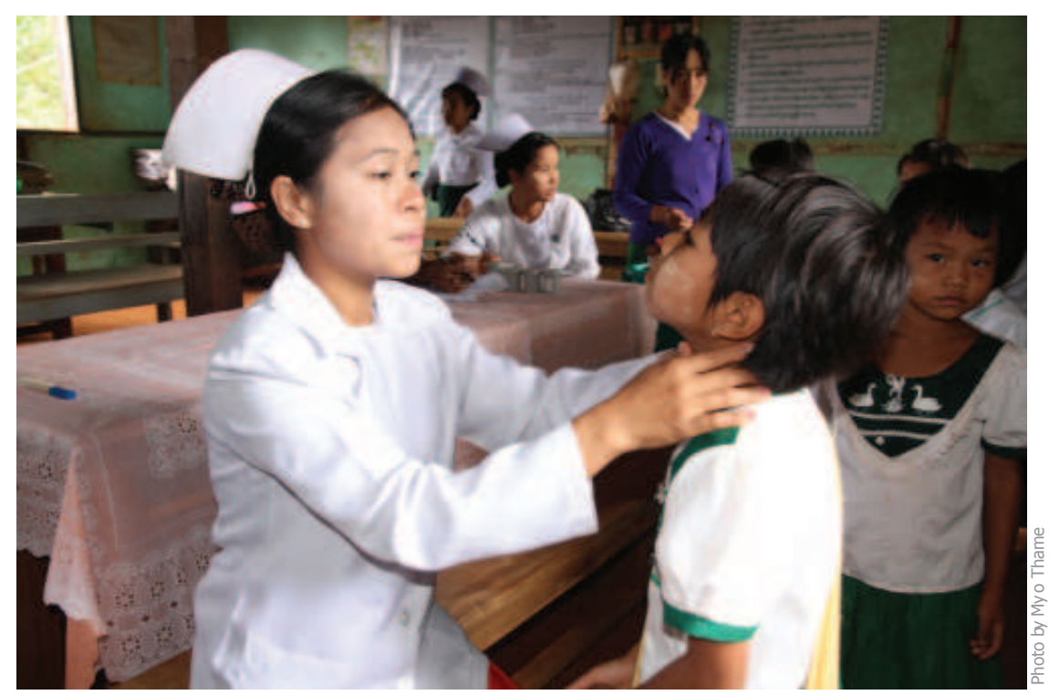
Regular health care check-ups are essential