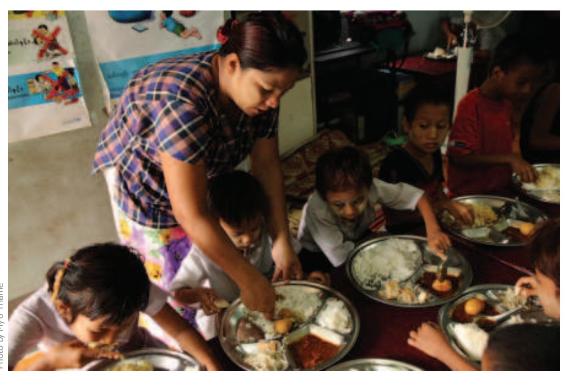
Children received breakfast and lunch at drop-in center, Daw Pon Township

300. A Child Abuse Prevention Outreach Plan will be developed to identify and serve infants and children affected by neglect, physical, emotional or sexual abuse, or other forms of exploitation. Protective, high-quality and nurturing services will be provided for such children, including temporary shelter homes, foster families, appropriate day care and development services, preschool education, kindergarten classes and primary schooling, and special health services and nutritional support, as needed. Wherever possible, every effort will be made to offer parent education and support, family therapy and family preservation services. Special attention will also be given to the prevention of child neglect, childhood injuries and physical, emotional and sexual abuse.