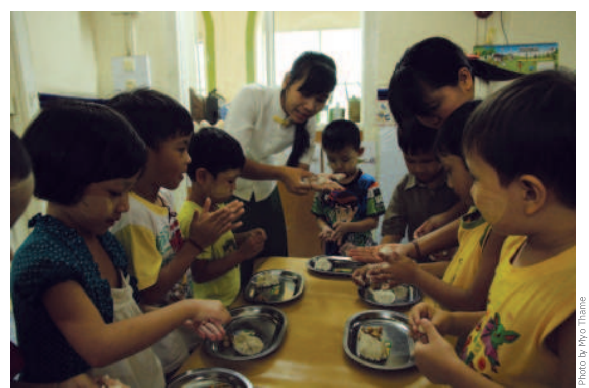
Celebrating our traditions (making Mont-Lone-Ye-Paw) while being in preschool