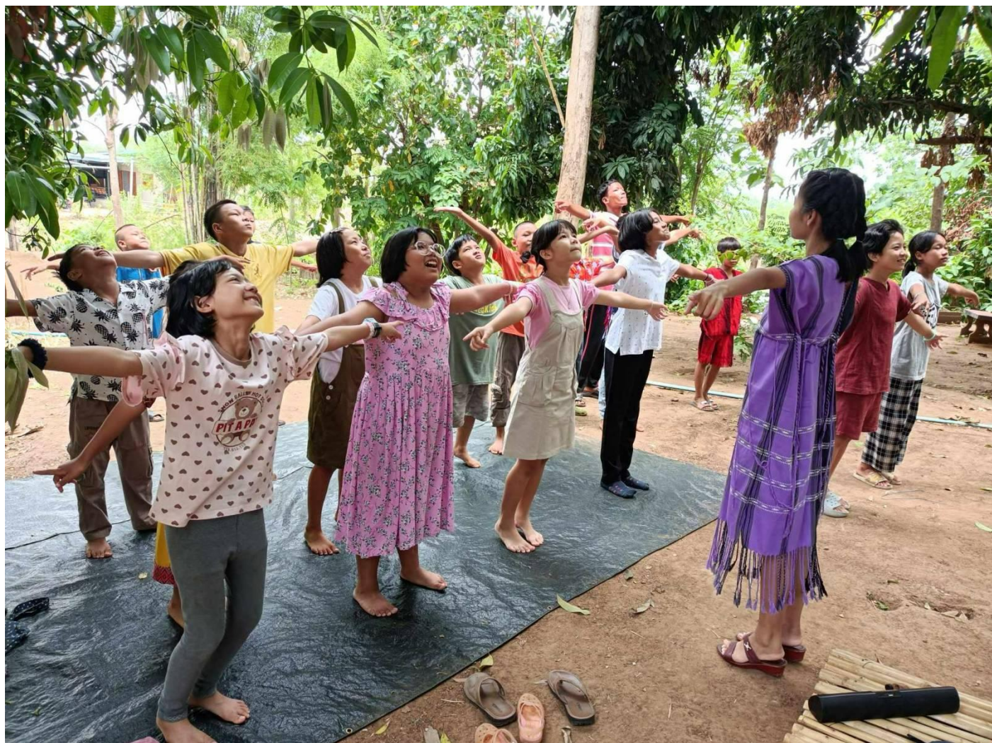
Photo: Children and adolescents actively engaging in Child Friendly Space Activities at an IDP site in the Southeast.

resource mobilization. The Inter-cluster Coordination Group (ICCG)'s Information Sharing Protocol allows for this information to be shared in a non-identifiable manner.