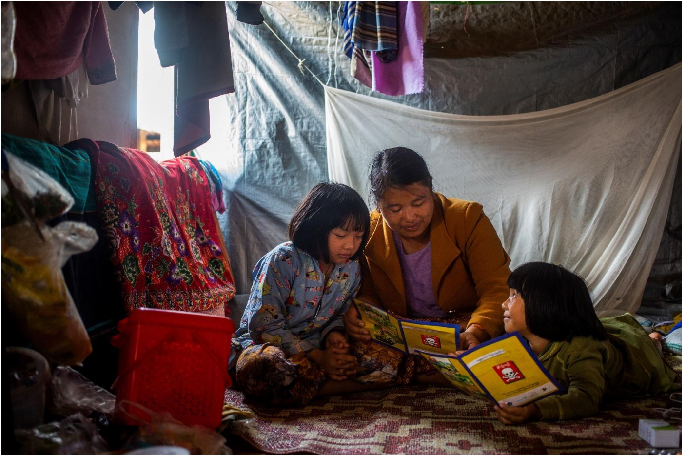
Photo: In their shelter in Shan State, a displaced mother reads a UNICEF-distributed mine risk handbook to her children. Shan has the highest civilian landmine casualties in Myanmar.