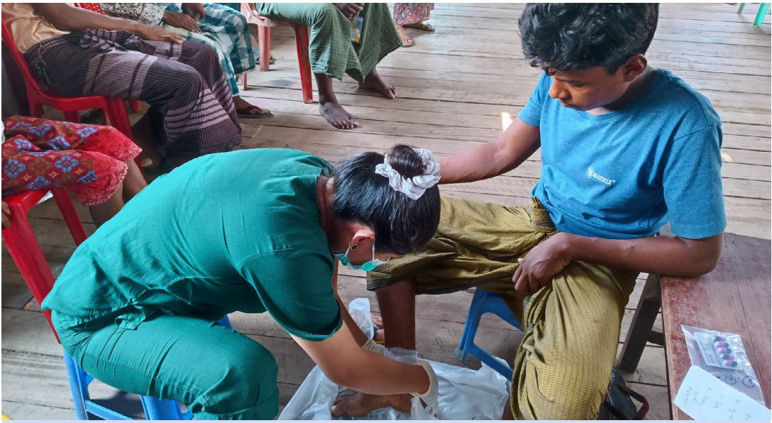
IOM mobile clinic activities in an IDP camp in Sittwe, Rakhine State.

There continues to be obstacles to the roll out of comprehensive inter-agency needs assessment, due to bureaucratic impediments, limited access in specific areas due to the ongoing conflict and logistical barriers. With telecommunications and electricity not yet fully restored, information remains limited. However, some sectoral information has started to emerge from partners who were already on the ground, highlighting shelter, NFIs, health, water, sanitation and hygiene (WASH) and food as the key priority sectors for the response.