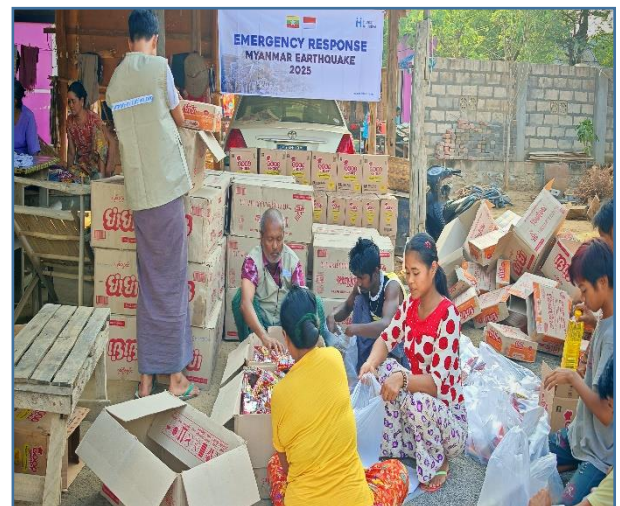
Distribution of Food Packages to 215 families in Suu Lay Kone area, Kyaukse, Mandalay